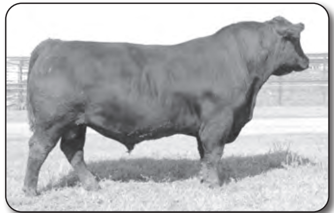
LOT 78 SIRE: CONNEALY TREASURE 0369

• Recommended for heifers. Treasure Chest 0180 earned the top spot at weaning with an impressive 938 pounds with a weaning ratio of 118. His dam has earned a weaning ratio of 105 on her five calves.