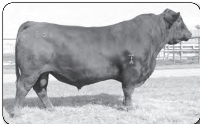
MATERNAL BROTHER OF LOTS 10-12: AMDAHL'S ROCKETEER 636