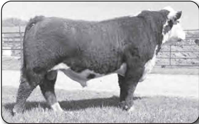
SERVICE SIRE: UPROAR 946