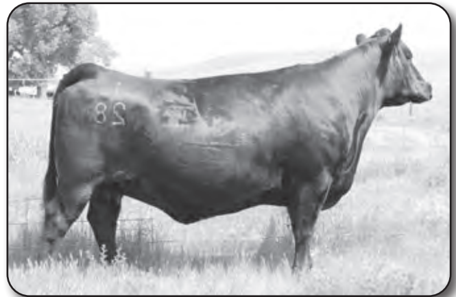
LOT 24 DAM: D R LADY BEULAH 128 DONOR DAM FOR LOTS 16-19