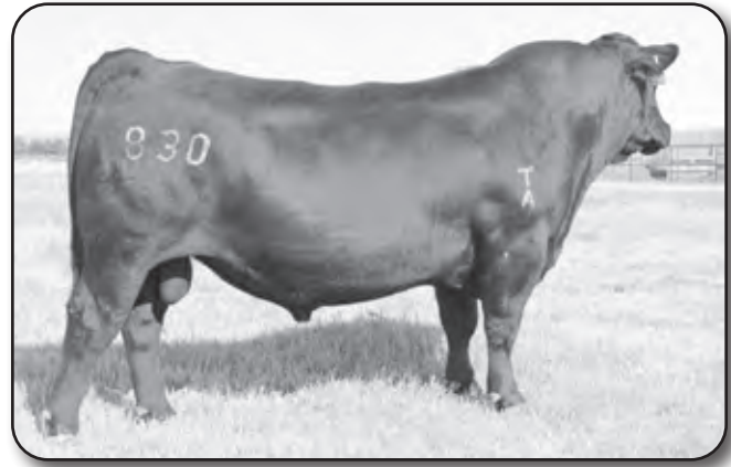
LOT 101 AND 102 SIRE: AMDAHL RANGE MASTER 830

• Recommended for heifers. 0135 has more Pathfinder cows in his pedigree than any other bull in the offering.