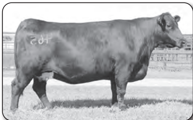
DAM OF LOTS 10, 11 AND 12: AMDAHL ERICA 431-465

These three full brothers are one of the greatest opportunities in the 2020 offering.