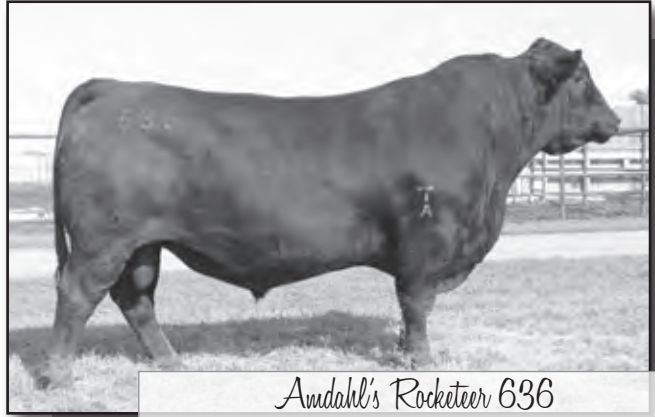
Amdahl's Rocketeer 636 Reg. No.: *18529618