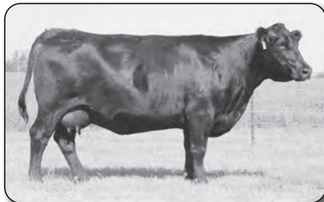
LOT 94 DAM: S A 322 GLORY 681 339

• Recommended for heifers. 050 is out of the oldest and most proven cow in the herd.