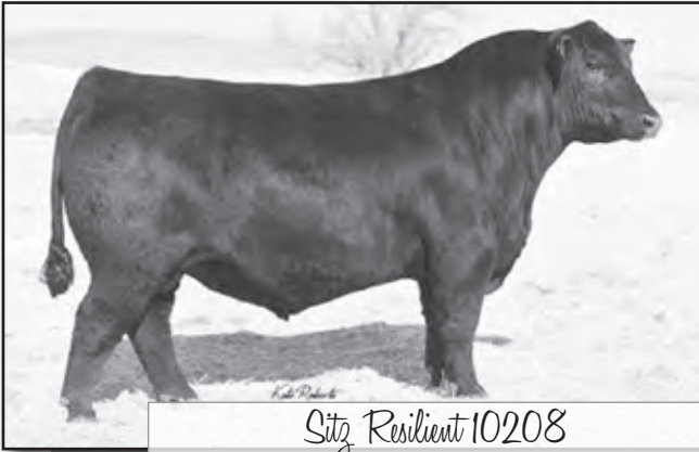
Sitz Resilient 10208 Reg. No.: 19057457