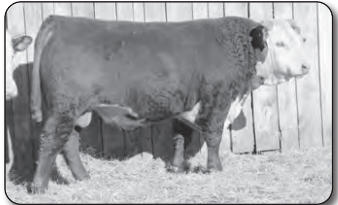
SERVICE SIRE: KB L1 DOMINO 5104