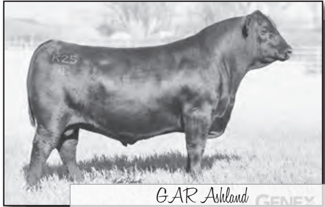
GAR Ashland Reg. No.: 18217198