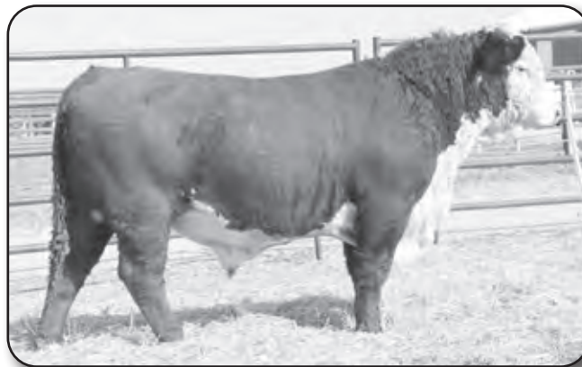
SERVICE SIRE: TA L1 DOMINO 933