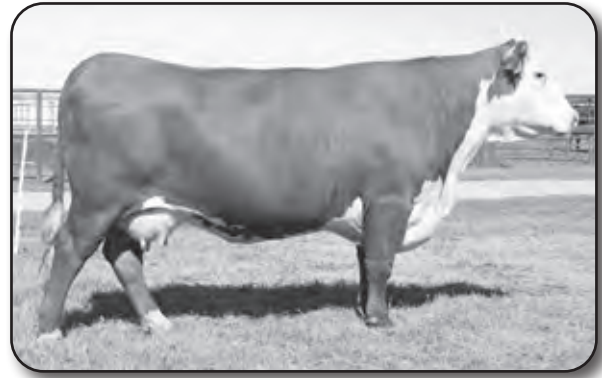
LOT 118 DAM: KB L1 DOMINETTE 376 A

Lot 118 TA L1 DOMINO 0308H ET BD: 01/12/2020 Reg No: 44172620 Tattoo: 0308