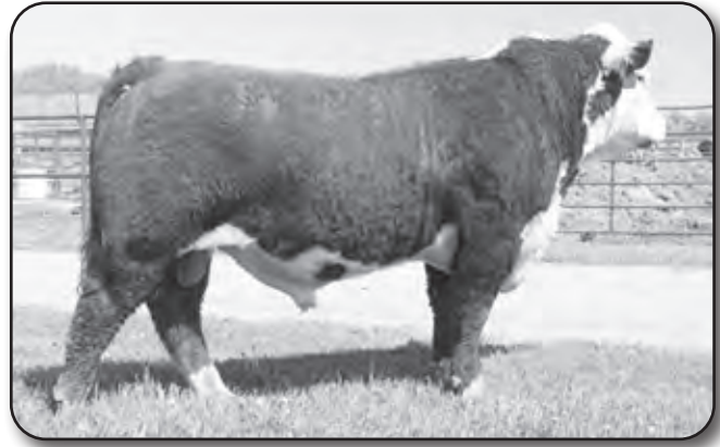
LOT 152 SERVICE SIRE