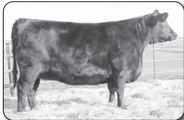
LOT 30 & 31 DAM: AMDAHL ERICA HICKOK 104-544