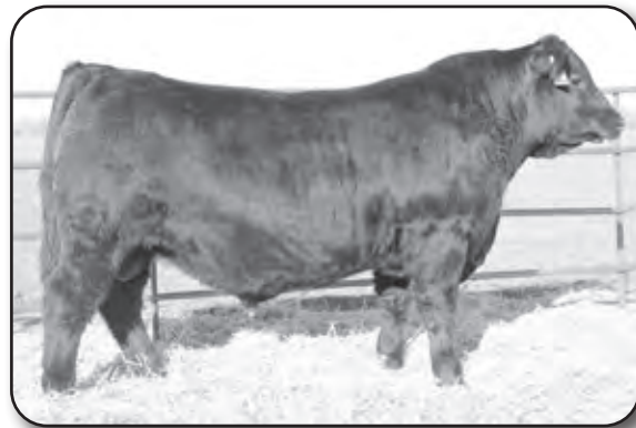
LOT 30 & 31 SIRE: AMDAHL LANDMARK 712