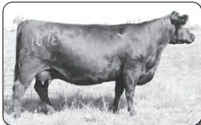
LOT 93 DAM: AMDAHL'S QUEEN B P 709-3101

• Well-balanced bull for maternal and performance traits.