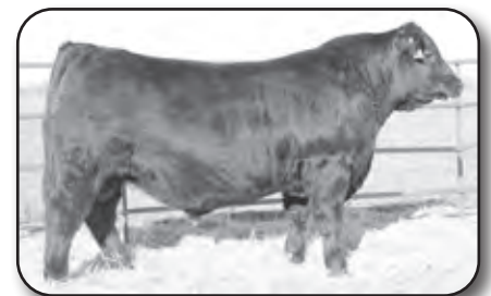
LOT 56 SIRE: AMDAHL LANDMARK 712