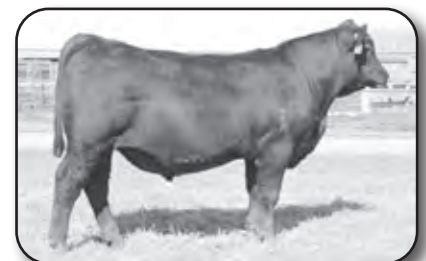
LOT 37 FULL BROTHER