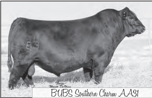
BUBS Southern Charm AA31 Reg. No.: *17853196