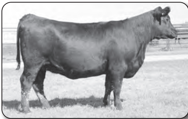
LOT 144 DAUGHTER: SOLD TO SUNRISE ANGUS IN THE 2019 SALE.