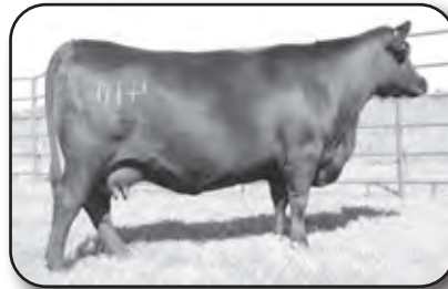
LOT 38 DAM: AMDAHL'S BLACKBIRD 133-410