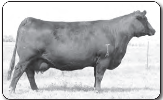
LOT 151 DAM: AMDAHL'S DIXIE ERICA 1188-933