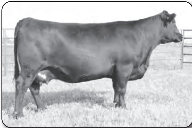
LOT 25 DAM: AMDAHL MISS UPDATE 616-5117