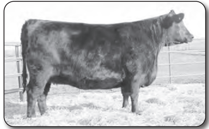
DAM OF LOTS 7-9: AMDAHL ERICA HICKOK 104-544

Champion Pen of Bulls and the heaviest set of bull calves at the 2020 Central States Fair