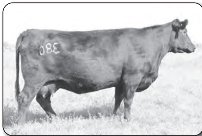
LOT 28 DAM: AMDAHL MISS HOMER 172-380

• Stout, powerful and a true standout in the pen best describes 064. He earned a weaning ratio of 104. • His dam, Amdahl Miss Homer 380 has worked her way to Pathfinder status and has earned a weaning ratio of 105 on her six calves.