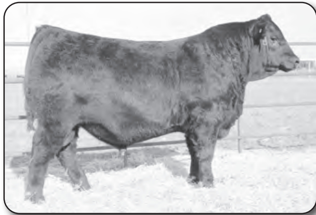
3/4 BROTHER TO LOT 73: AMDAHL'S BRUISER 724

We are offering FREE wintering on the Bulls!