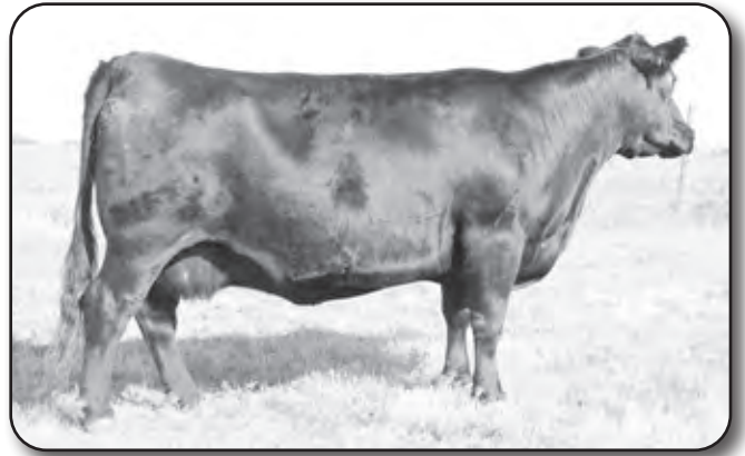
LOT 148 GRANDAM: PAR TRAVELING WESTWIND 72

• 653 is a granddaughter of the great West Wind 72 cow that served in the herd 18 seasons. Great mating combination here. • She sells safe bred to Southern Charm with a female due 1-23-21.