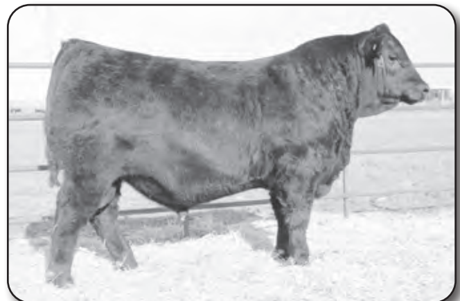
LOT 87 SIRE: AMDAHL'S BRUISER 724

• 086 is deep-bodied and backed by the 7197 cow that has earned a second to none weaning ratio of 105 on her twelve calves.