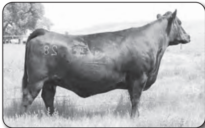
LOT 16-19 DAM: D R LADY BEULAH 128