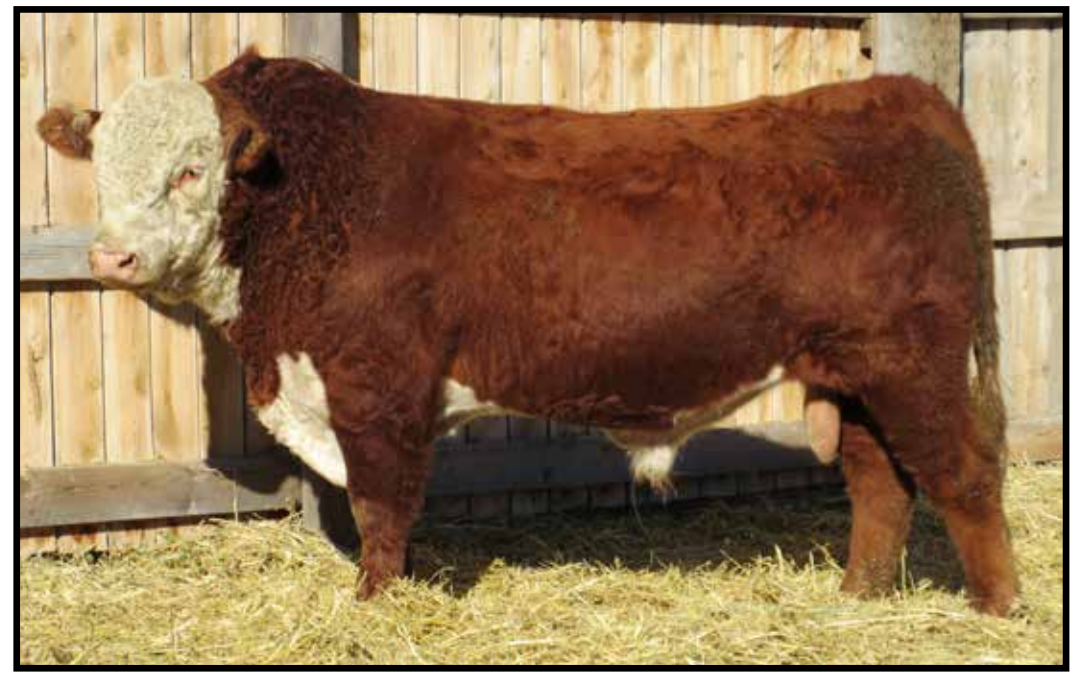
B PAW PATROL 19H