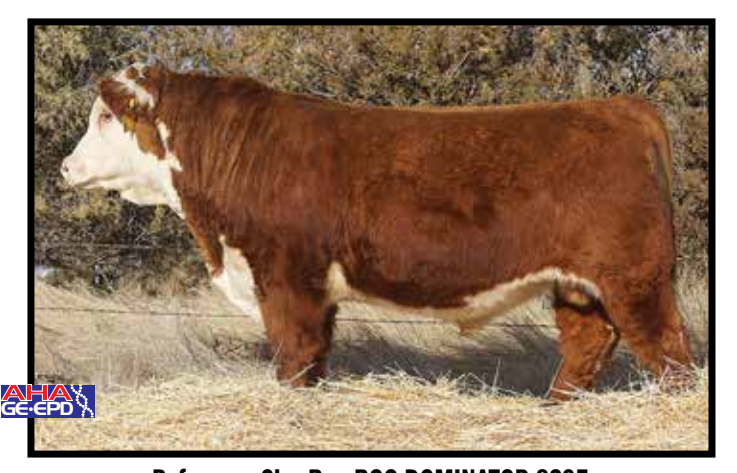
Reference Sire B — BCC DOMINATOR 829F

• He is the Hereford bull to use for maternal heterosis because his daughters are moderate in size, easy fleshing and very maternal. Long Haul is a potent, cow herd-builder. His birth to yearling spread is dramatic and we have again been able to stack low birth weight and have performance. At four years of age, he left here this fall having produced three outstanding calf crops and sold a large volume of semen. He looked and moved great. Calving ease with carcass isn't easy to find and it is very rewarding to have partnered on a great sire like this. We have two more years of these calves coming and hope they light up your program like he did ours. Eventually we will have to sell some daughters so let us know if you'd like to own one. 24% of the Long Haul progeny going through the AHA website have been born here. Lot 19 topped our feed efficiency trial and lot 18 had the biggest ribeye. No boxes to check, that's a proven herd bull.