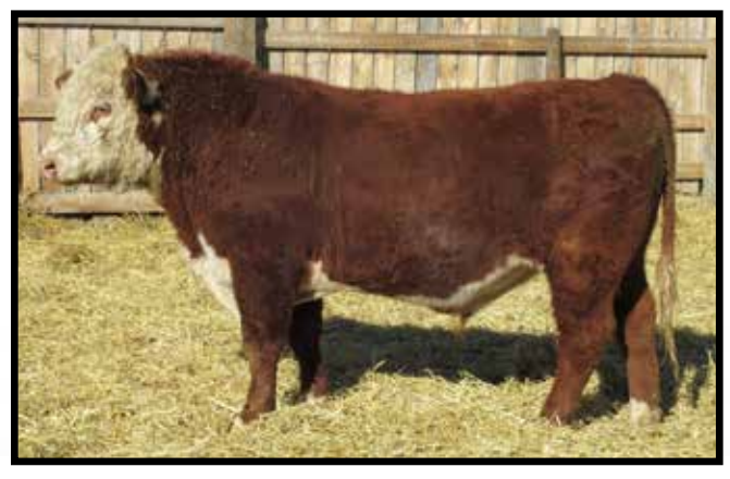
B DOMINATOR 70H

His Anchor mother is three generations of deep and wide. They all have exceptional milk flow and are easy keepers. Several of our heaviest weaning calves come out of this cow line and they really perform. Second Built Tough calving ease son.