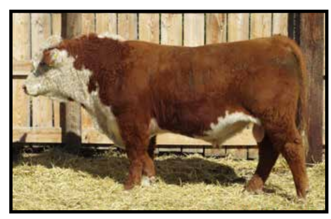
B DOMINATOR 95H

Dam is exceptional long-necked, long-sided 28X daughter that gets it done. He is deep-bodied, wideset and packs the meat.