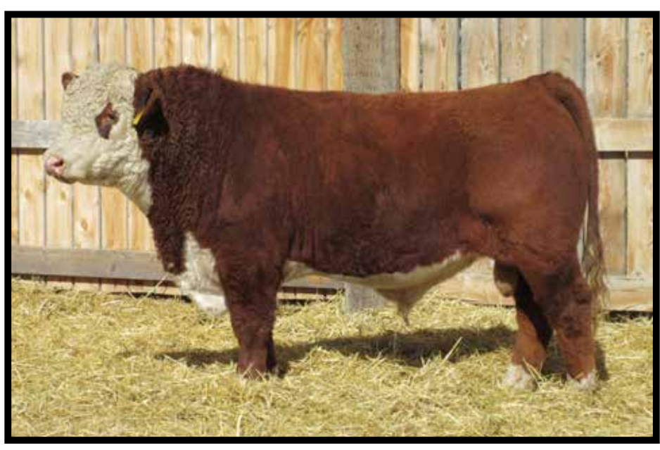
B HEAVY WEATHER 25H

• He has the most timber under him as we can offer out of the Long Hauls. There are two generations of deep-bodied cows with a big spring of rib behind him. By the pound he's going to add a bunch more and you will really know his calves when you put them across the scales.