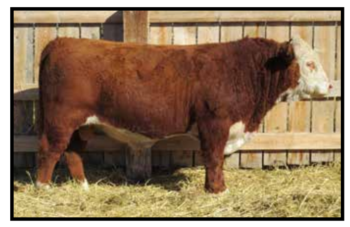
B AMAZED 71H

• He has big goggle eyes, extraordinary muscle shape and carries down into his lower quarter. Smooth in his composition and proof 1F outbred himself. He is correct in front and moves right. Second calf from what will be a great cow.