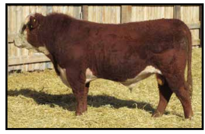
B SLAMMER 50H

• His dam produced 9 calves with WI an YI indexes greater than 104. She had great pigment with one of the awesome haircoats we have ever had. He scorched his WI with 109 and stepped up to index 111 at yearling. He spent all summer walking the fence looking for something and I think he will be filled up and look like the herd bull prospect he is by sale day. He is very long, smooth-made and exceptionally correct for a big bull.