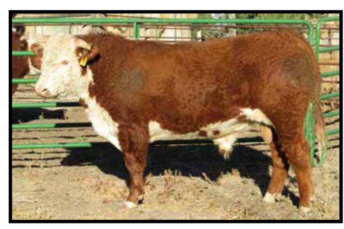
B ENCORE 51H

• He has an Outcross pedigree from one of our oldest and heavy milking Kingpin daughters. You have to appreciate the bulge and thickness in this bull's rear quarter and the way he carries that width all the way down the top. He has two nice red eyes it has lots of potential. He scanned an actual REA at 15.03 and adjusted to a 13.87, indexing 114. He is rock solid to increase red meat.