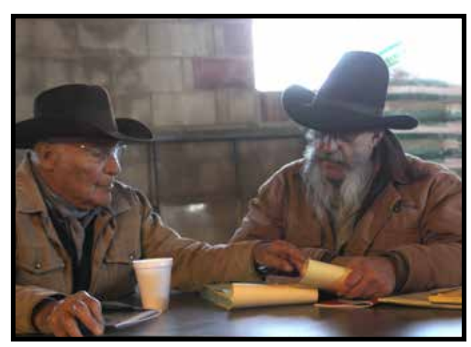
"That brand looks easy enough to read!"

This is real carcass data, not an EPD, and I would trust it.