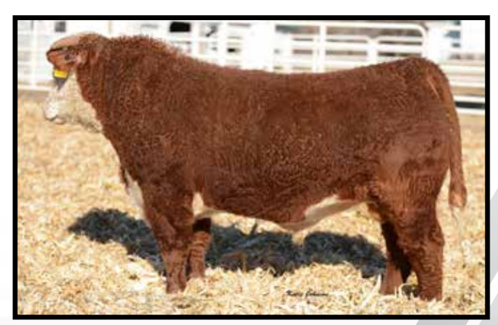
H HOMETOWN 5343ET - Sire of Lot 4H Several other sons sell!

631/100 856/89 10.82/89 3.20/99 72 • To make the best better, we try and this heifer did. He is a great heifer bull candidate with full eye pigment and has textbook eye set and breed character. This cow family is very moderate in frame but stylish. He could be a very important calving ease tool. Here is quality.