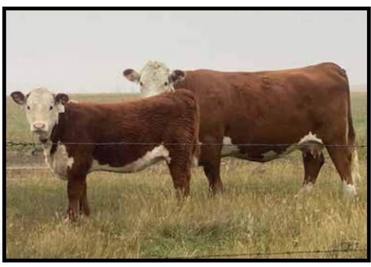
Dam and full sister to 234G