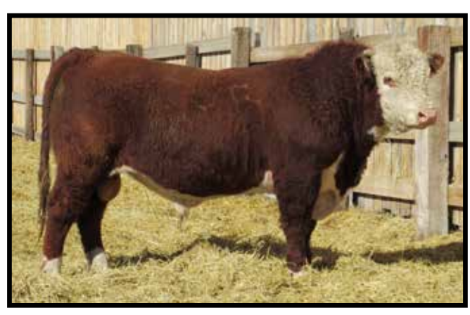
B STORMBREAKER 37H

• He is one of the most aggressive in his frame and performance of the Long Haul sons and I think he's great. His dam has more mass and bone under her than almost any cow in the herd. She is Cinnebear's only sister and will calve here next year at 12. This bull's full sister just had her first calf and is a role model mirror to this bull, slightly smaller in frame, very feminine and gave a lot of milk. If you want to find out what Long Haul can do and do better than a lot of other cattle you should find this bull.