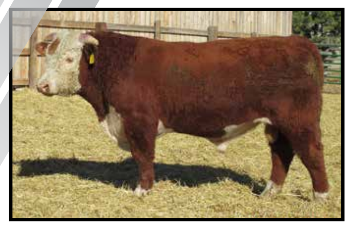
B AMAZED 54H