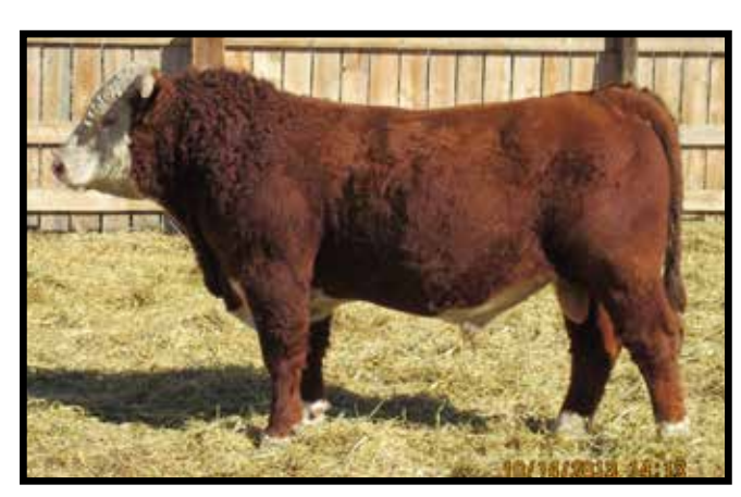
B TIME IS NOW 64H

• There are only two Times a Wastin sons in the sale. We retained a used a son of 204 and she has four daughters in the herd. She has more extension and size than most any Sensation daughter in the herd and is made right with great bone. She has full pigment and breeds extra in her progeny. This flush of three Sensation sisters out of Sandy has been exceptional. Read his carcass data before his EPDs.