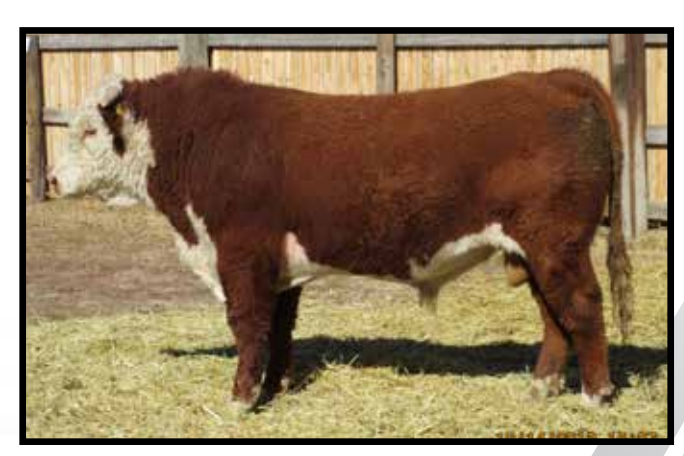
B OUTCROSS 15H

He is as smooth as they come for a performance bull. He is long, strong-topped and made in one piece. There are two Outcross sons this year and he is an easy choice as a herd bull prospect. He crushes both performance and carcass ratios. This bull has two red eyes and his dam has already developed into one of our premier cows. Every time an Outcross heifer leaves the chute we say, "I've got to use that bull more."