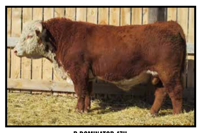
B DOMINATOR 47H

The pedigree says female progeny will be exceptional and 140 is textbook in every way. There is great pigment, eye set, plenty of stretch, lots of frame and a bull with a long stride. Horn breeders hook up on the Long Haul advantage and keep every heifer out of this one. His SAREC performance speaks volume about what he can do for your bottom line, finishing number five composite.