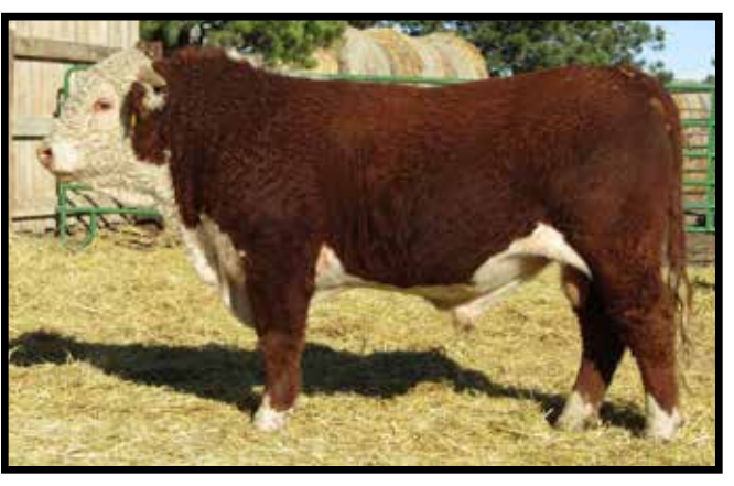
B BUILT TUFF 69H

This is the same cow family as lots 19 and 62. If there is power in the blood it is here. He is not as flashy as some but don't miss a chance to pick up a dominator with really nicely balanced ratios from a top-notch cow family.