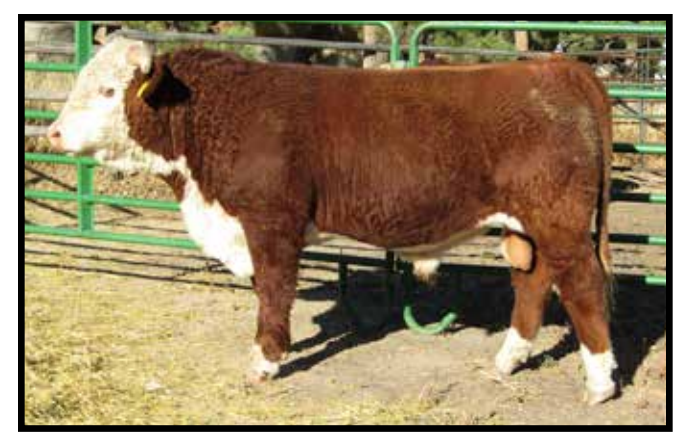
B STORMBREAKER 116H

• This is the opportunity to find a great, horned prospect with the Long Haul advantage. A young bull, he finished number one on feed to gain and number 2 in RFI (-4.89). There should be a long pause here because this is the greatest shot you'll have at taking advantage of our feed efficiency data. He is not average but exceptional. Same cow family as lot 60.