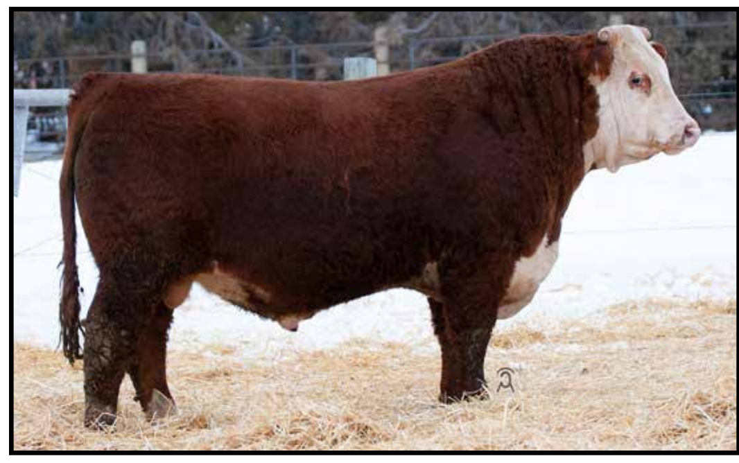
HH ADVANCE 8392F ET 43966191