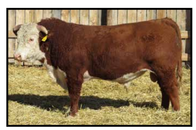
B DOMINATOR 14H

He has a great phenotype and is outstanding and correct in his structure. A stylish bull, he has a good spring of rib and Is wide down the top. There are two really big cows behind his PI dam and I expect him to grow. He finished right in the middle, SAREC and posted a double 107 at weaning and yearling. That is serious performance. He is a herd bull prospect. Great big $CHB index is a good indication of the balance in his performance.