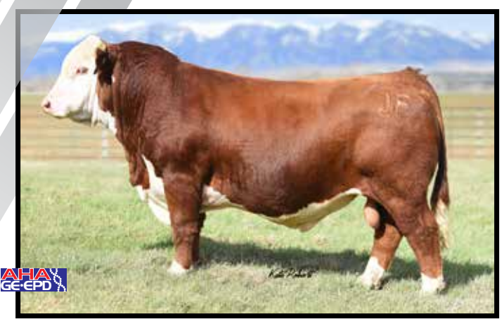
Reference Sire A - NJW LONG HAUL 36E ET