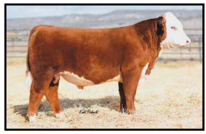
CHURCHILL NIGHTCAP 7256E - Sire of Lot 13H

He is massive, big-middled with good eye pigment and a nice spot on his face. All ratios, both performance and carcass, are better than average with the big-time EPD profile. He is out of a first-calf 314 daughter with a nice, silky udder and is moderate in her frame. He is one of four Nightcap sons in our sale. He has every chance to be better than his sire. Brothers sell as lots 39, 42 and 81.