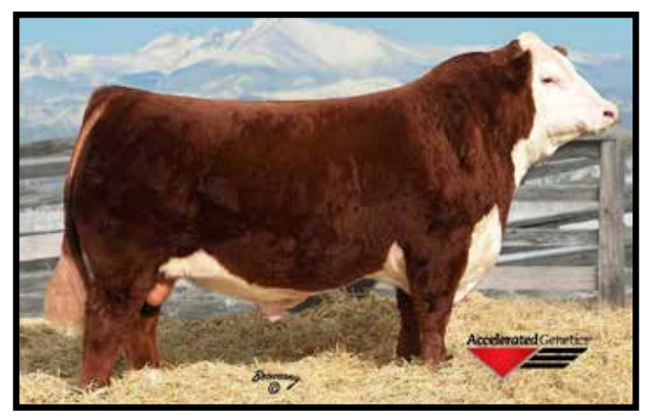
KT SMALL TOWN KID 5051 - Sire of Lot 1H

· His sire, Small Town Kid, is pictured, tells you why he is an easy choice on heifers. He sires below breed average for birth and is highly proven with over 1,100 progeny This is a heifer-safe pedigree. Grandam, 809, was flushed for export in her day and there is a lot of quality here to go with calving ease. The daughters have made really nice cows here and his heifers will be no exception.