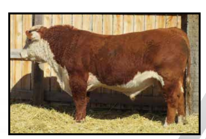
B DOMINATOR 66H

You can't make him any longer and keep it together. He has tremendous bone, long stride and a tight sheath. His performance ratios exceptional. REA is tops and has a get-'er-done dam. Her WI on 8 107 and 103.4 YI. There is a big $CHB number for this big-league prospect and he deserves it.