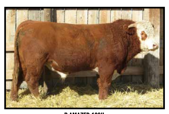
B AMAZED 109H

Two red eyes, good eye set and lots of breed character in him. Dam comes from the same family as last year's top seller to Shaffer. Good WI and marbling in this quality prospect.