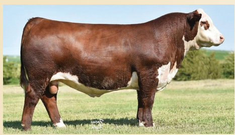
NJW 79Z Z311 ENDURE 173D ET