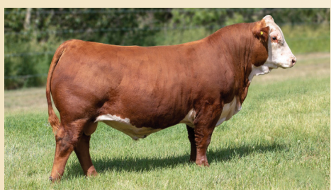
CSC 701 BOLDER 901