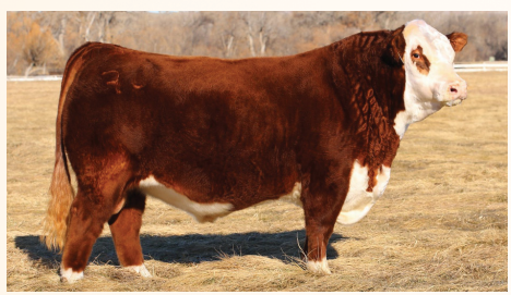
NJW 133A 6589 MANIFEST 87G ET