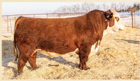
TH MASTERPLAN 183F