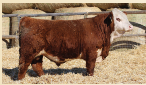
NJW 105F 34F SETTLER 190H