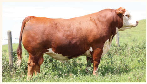
BIG-GULLY 173D FOREFRONT 46J