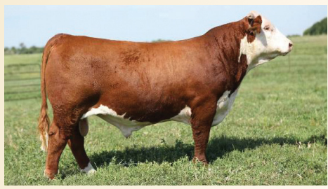
SR DOMINATE 308F ET