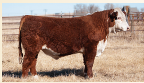
CRR 6589 MANDATE 082