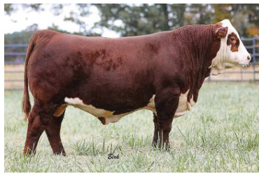
CMF 1720 GOLD RUSH 569G