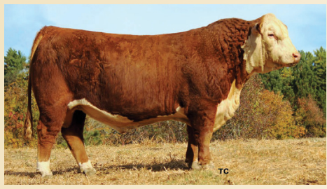
INNISFAIL WHR X651/723 4013 ET