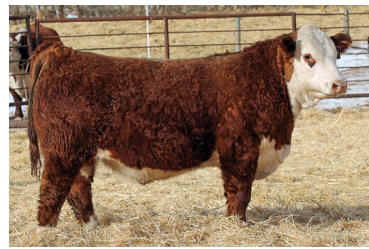
NJW 119E 87G ENDORSEMENT 216J