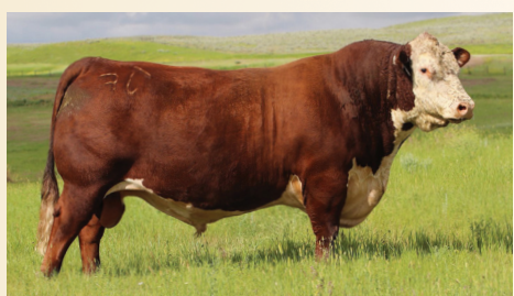
NJW76S 27A LONG RANGE 203D ET