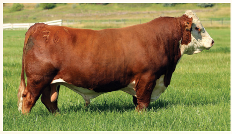
NJW 160B 028X HISTORIC 81E ET