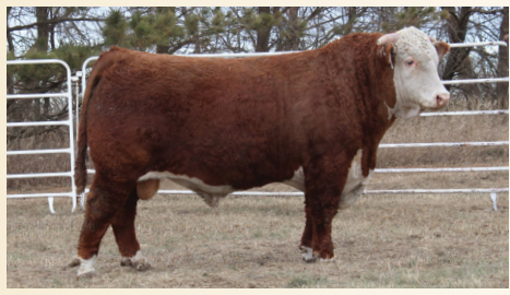
MH FRONTIER 6147