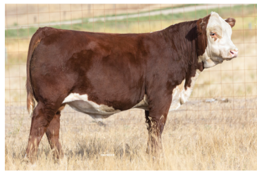
PCL 1G KRACKERJACK ET 80K