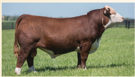
BOYD POWER SURGE 9024