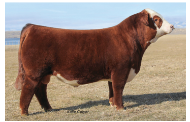
C ARLO 2135 ET