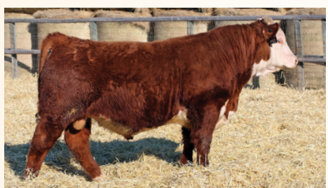
NJW 165A 88X COWCAMP 48F ET