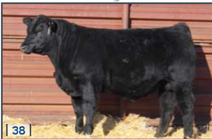
| 38 |