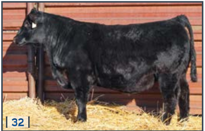
| 32 |