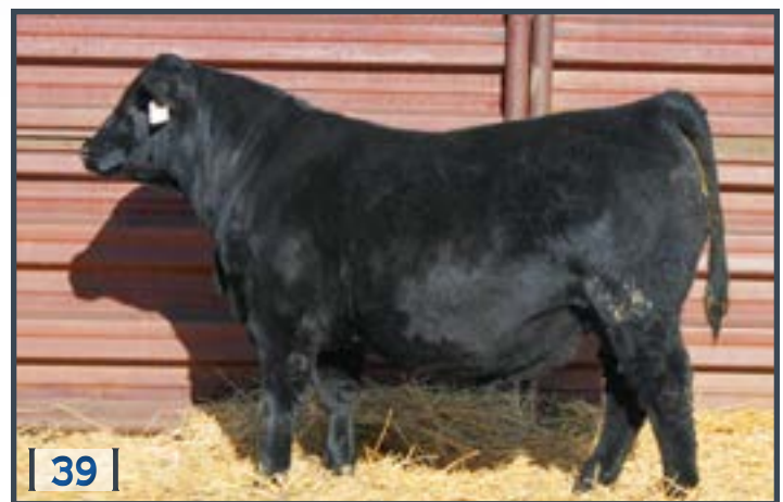
| 39 |

Lot 38 is larger framed and long bodied offering plenty of growth.