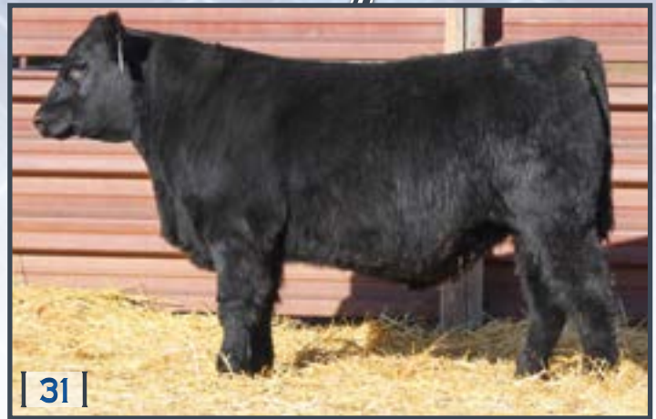
| 31 |