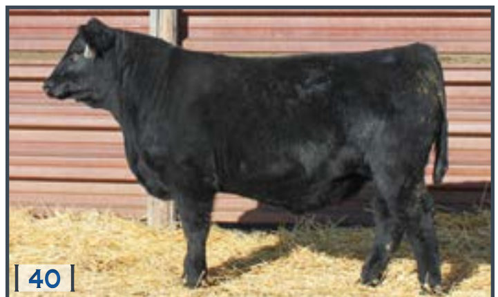
| 40 |

Lot 40 is a calving ease Dry Valley son that will work on heifers.