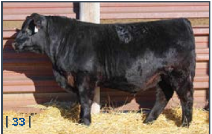
| 33 |