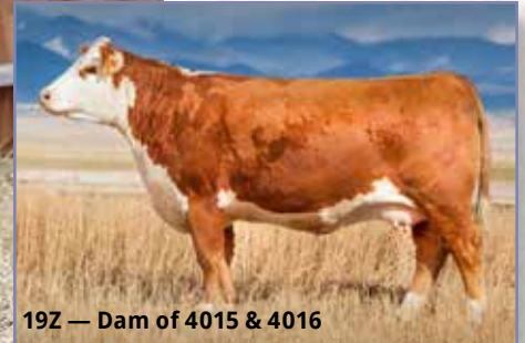
19Z — Dam of 4015 & 4016