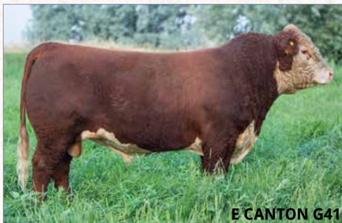
E CANTON G41