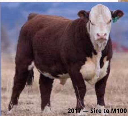
2017 — Sire to M100

Uniquely bred bull here. Dam F133 has produced exceptionally well for us and M100's sire 2017 was highly regarded by all who saw him. 2017 was lost to injury way too early in his career. M100 will sire functional cattle. He is also Homozygous Polled.