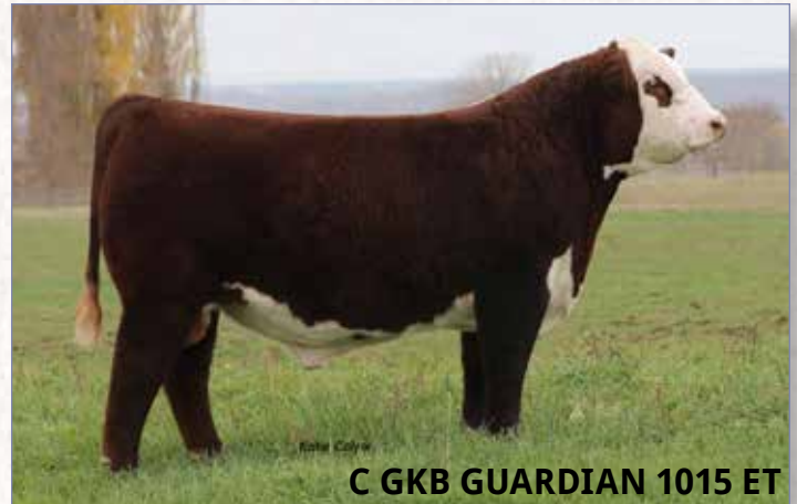
C GKB GUARDIAN 1015 ET