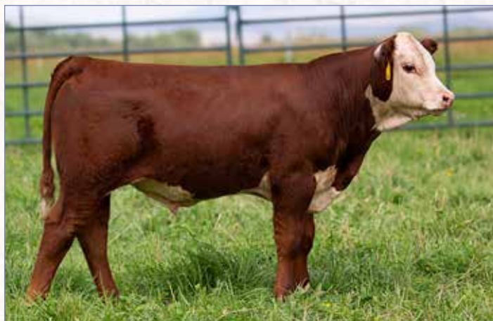
N12 - E 360L VANGUARD N12 Two Creek Ranch, MT