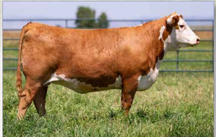
L30 - E 65J MATTIE L30 Craig Pelton, ND