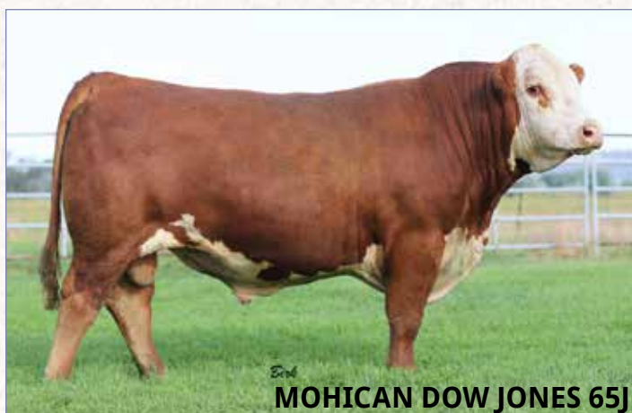
MOHICAN DOW JONES 65J

35K was our selection from the 2023 Atkins/Delaney bull offering. This Benton son offers calving ease/low birthweight with above average growth. 35K also posts stellar carcass EPDs. 35K has been greatly appreciated by all who see him. Exportable semen available.