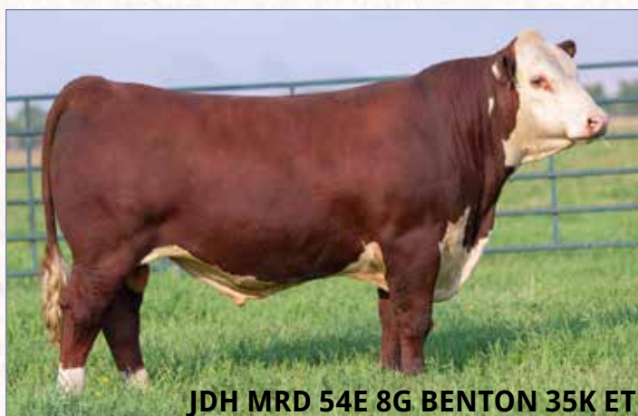
JDH MRD 54E 8G BENTON 35K ET