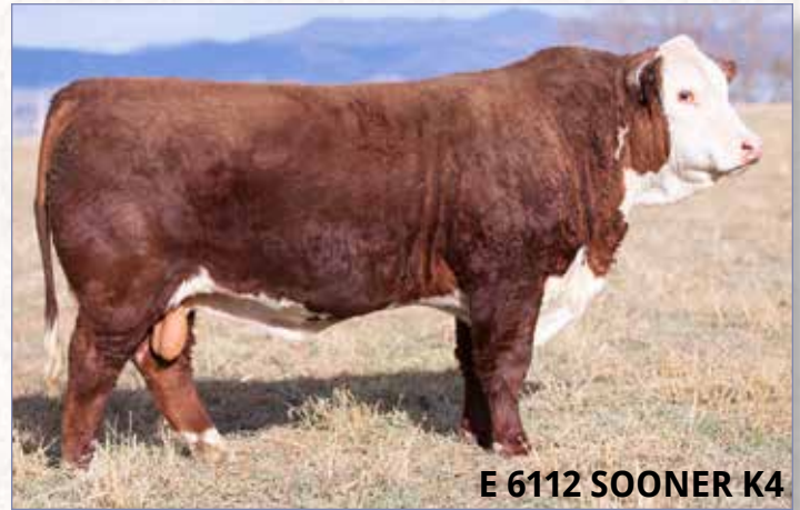
E 6112 SOONER K4

This guy offers up a stellar maternal breeding option, without sacrificing performance. K4 topped this contemporary group for weaning weight and yearling weight. This pedigree includes some real breed icons! K4 was highly complimented by all visitors this past summer and fall. K4 is homo polled.