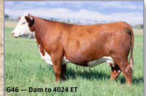
G46 — Dam to 4024 ET