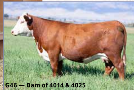
G46 — Dam of 4014 & 4025