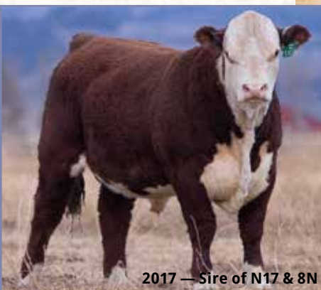
2017 — Sire of N17 & 8N