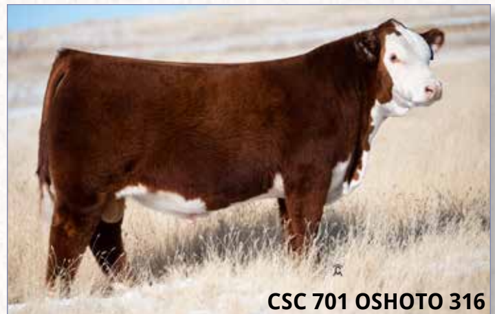
CSC 701 OSHOTO 316