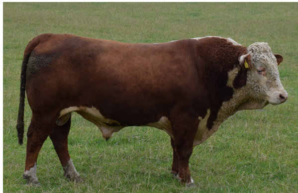
Ervie RL1 Achiever 202818