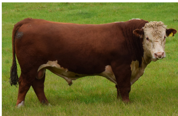
Ervie RL1 Achiever 212954