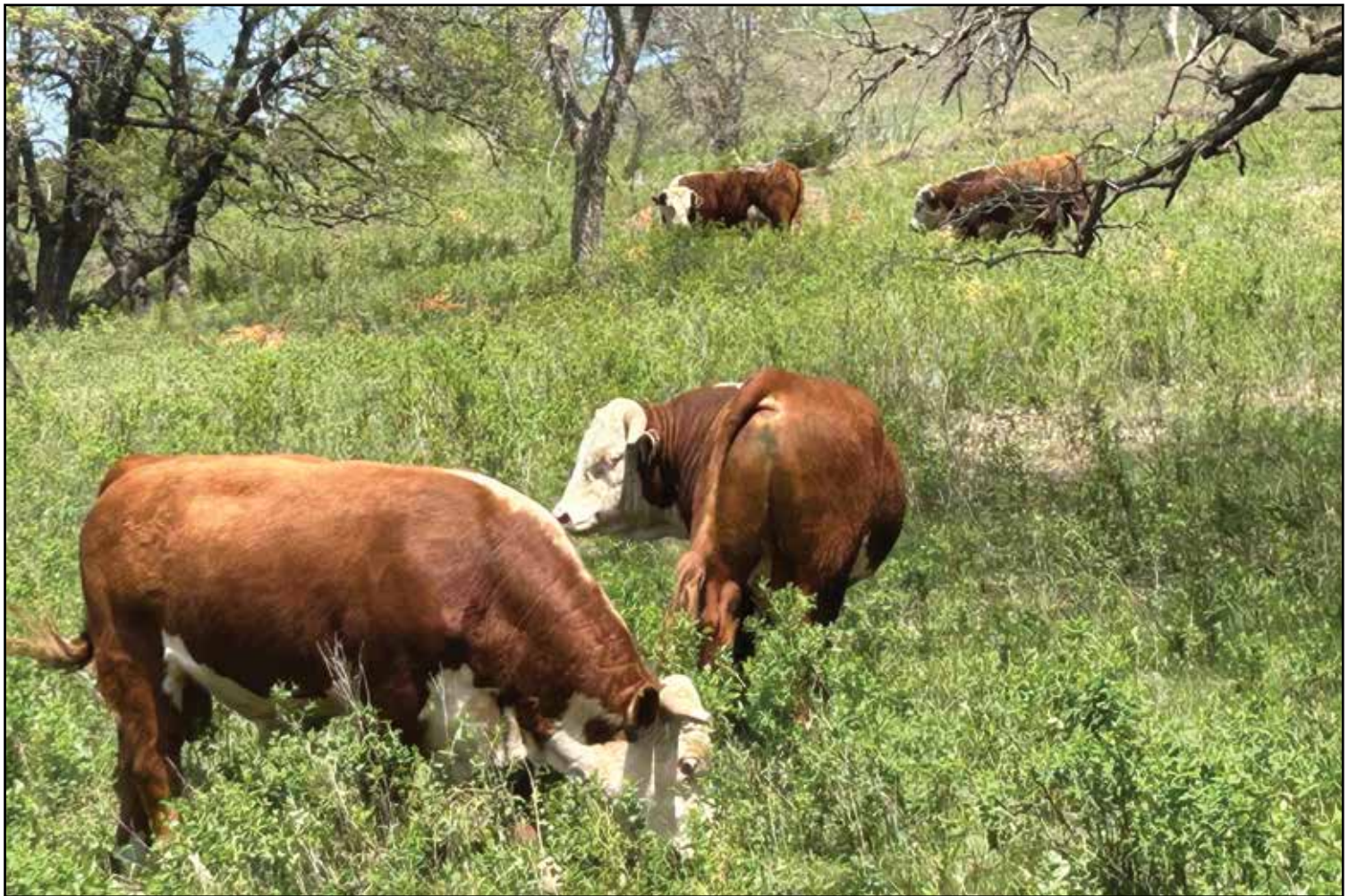
Bulls are developed over the summer months. They are out in the hilly pastures grazing, not in a feedlot.

"We believe 1235 will be a step up for our herd. Owned with Berrys in Wyoming. When I bought him, I thought he was the best bull at Cooper's sale and is a natural son of a Cooper top cow." - Lowell Fisher