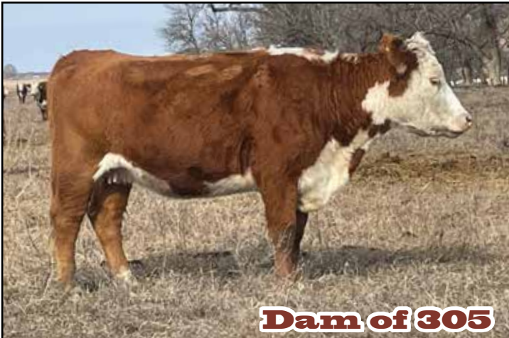
Dam of 305