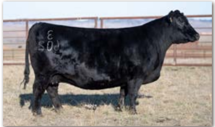
Wulfs Lucy 3602A - Dam of Lots 64-65

Lots 64-65 are flush brothers out of Wulfs Lucy 3602A, who records a WR of 5@99 and a YR of 2@101