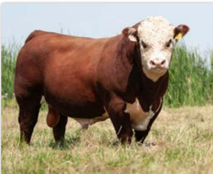
Pyramid Candor 9139 - Full brother to Lots 82-83 Owned by Coyote Ridge Ranch.