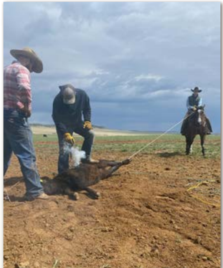
Lots 92-95 are flush brothers out of FHF 38Y Victra 150E, with a WR of 3@107 and a YR of 3@103