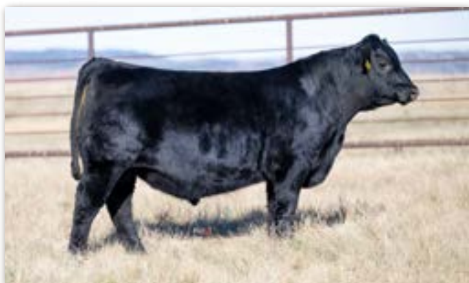
Lot 79 - FR Black Hills 3075