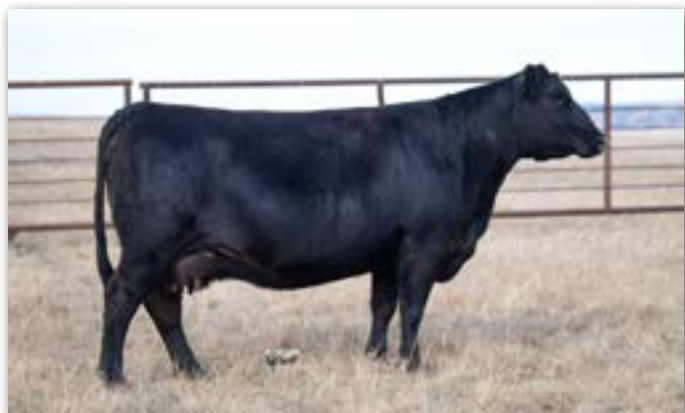
Glacial 1441 Missie 102C - Dam of Lot 26