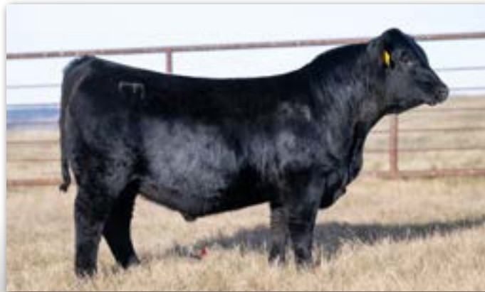
Lot 57 - FR Structure 3025