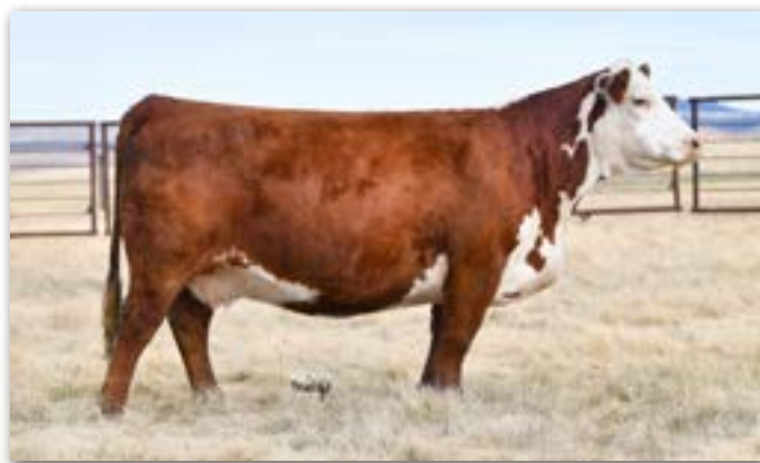
FHF 9116 RITA 187B • Dam of Lots 128, 129 and 134