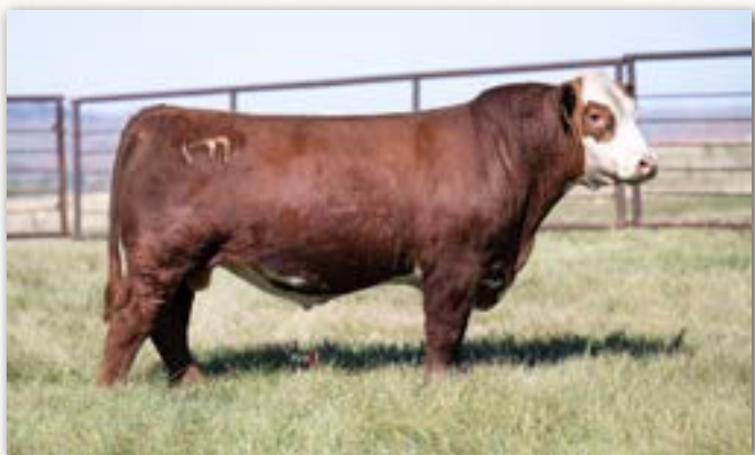
Lot 147 • FR HISTORIC 2581