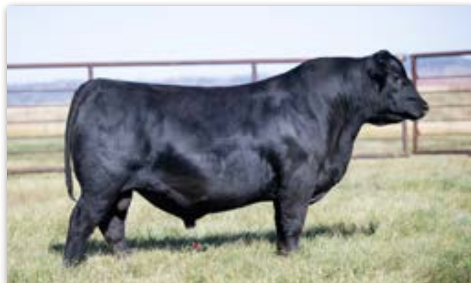
Lot 19 - Pyramid Coal Train 2087