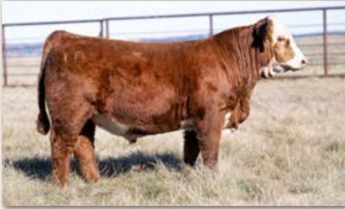
Lot 90 - FR KINGSLEY 3527 ET