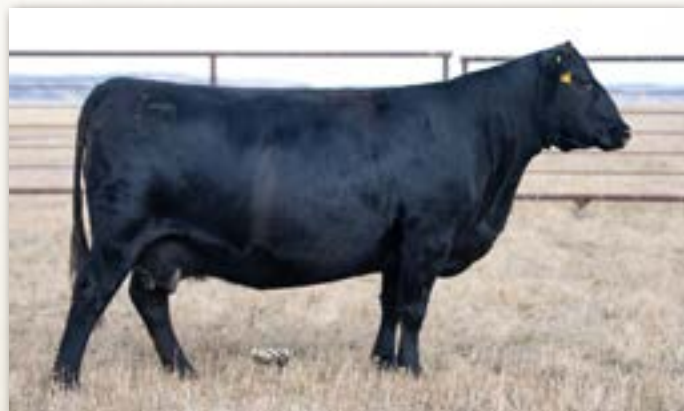
Glacial 1441 Missie 69C - Dam of Lots 13-15