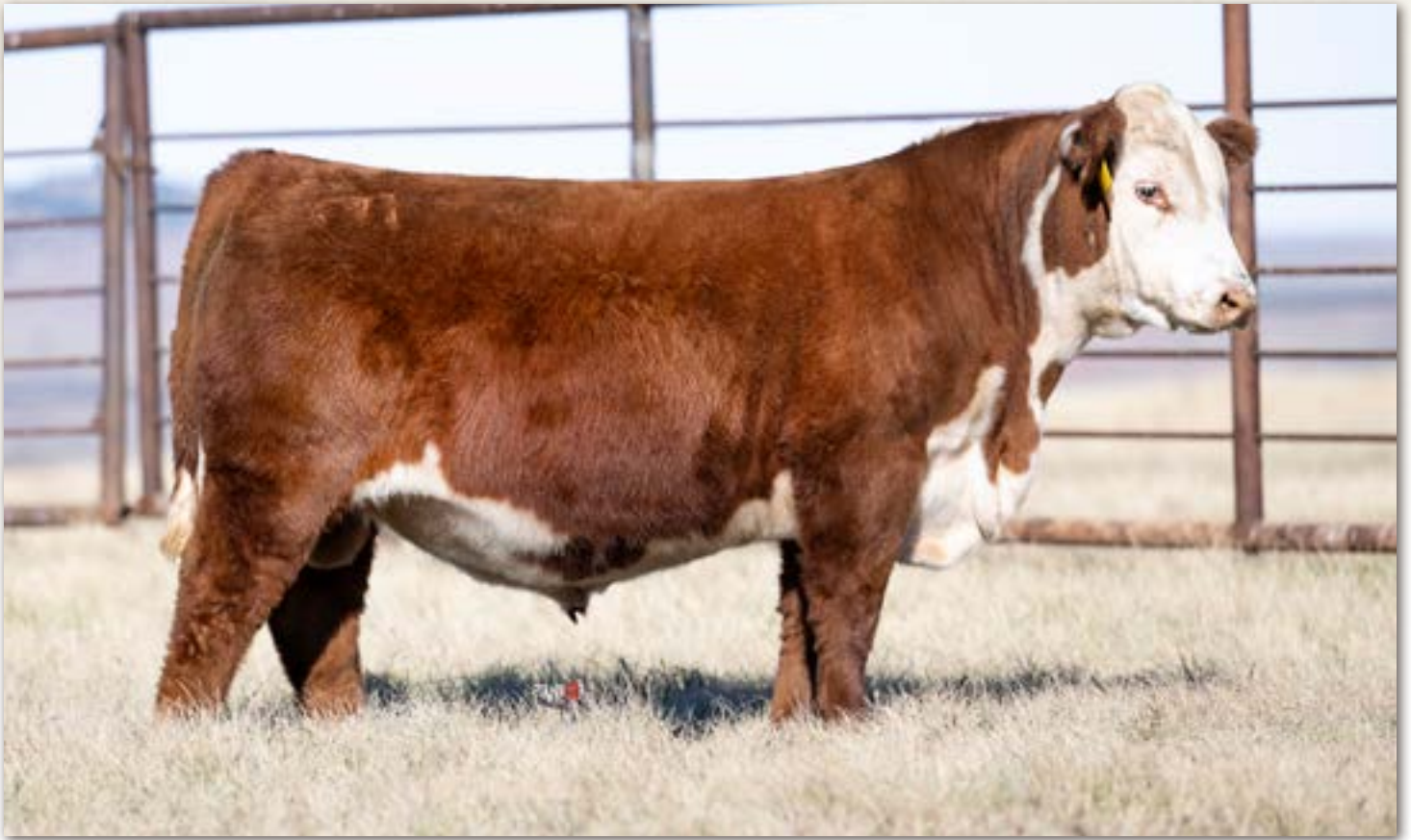
Lot 88 - FR THOMAS COUNTY 3522 ET