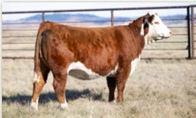
Lot 152 - FHF 0161 RITA 73K

Due March 10 to Bar JZ On Demand, Bull Calf