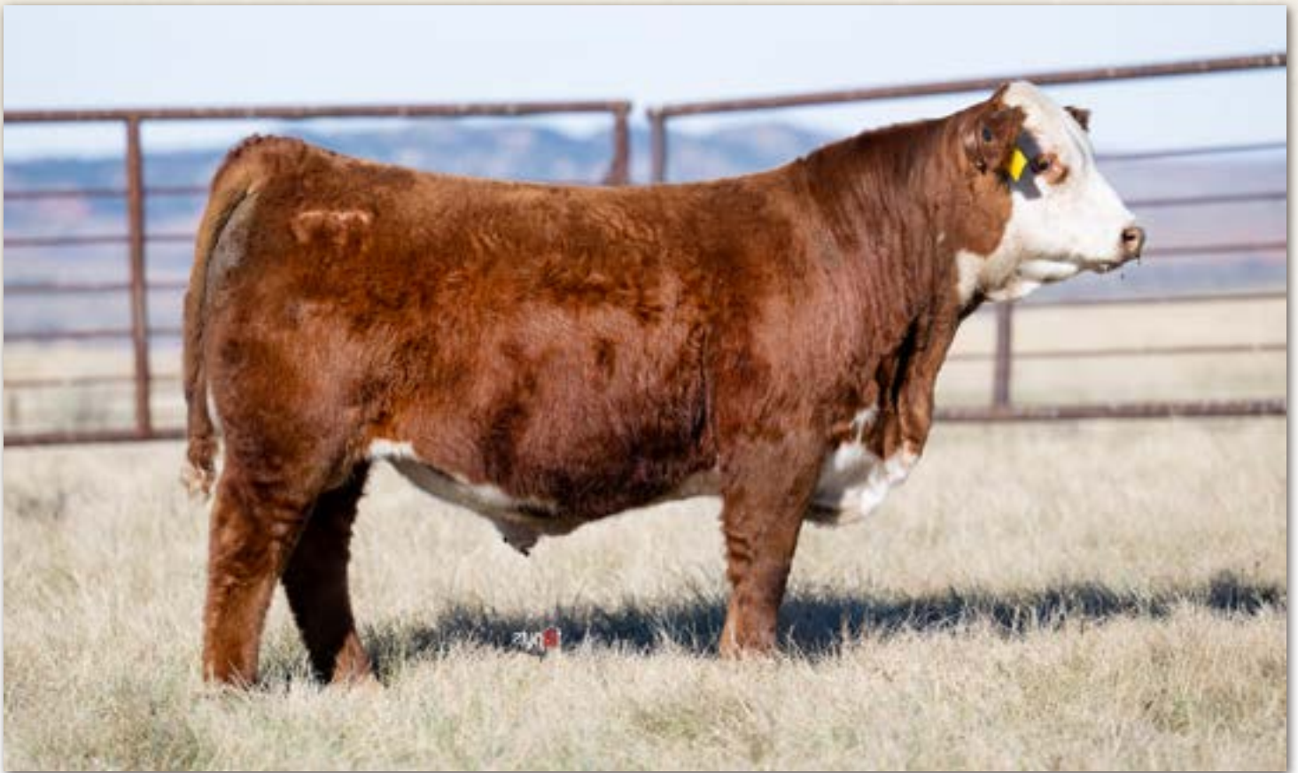
Lot 86 - FR Appomattox 3526 ET