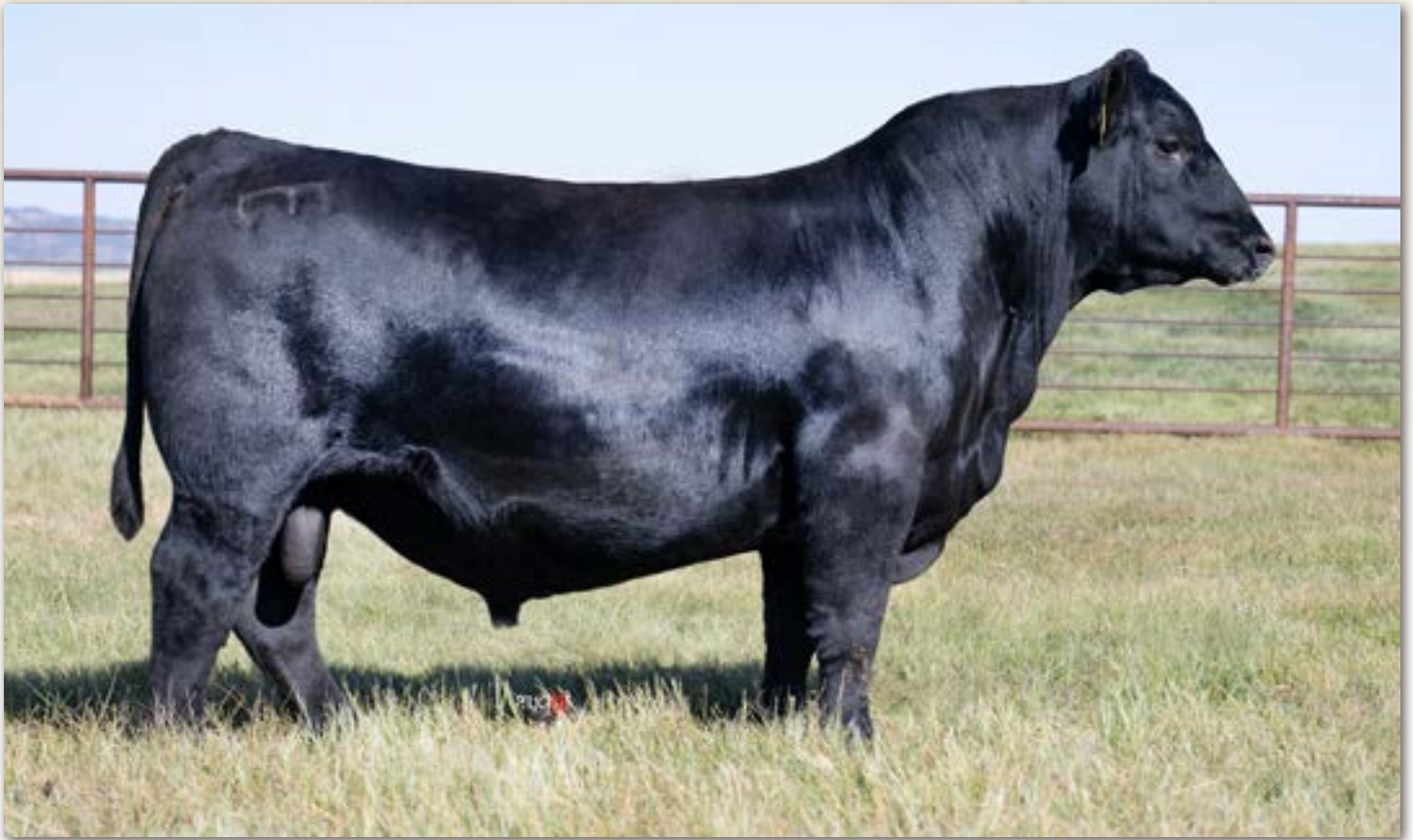
Lot 12 • Pyramid Coal Train 2093