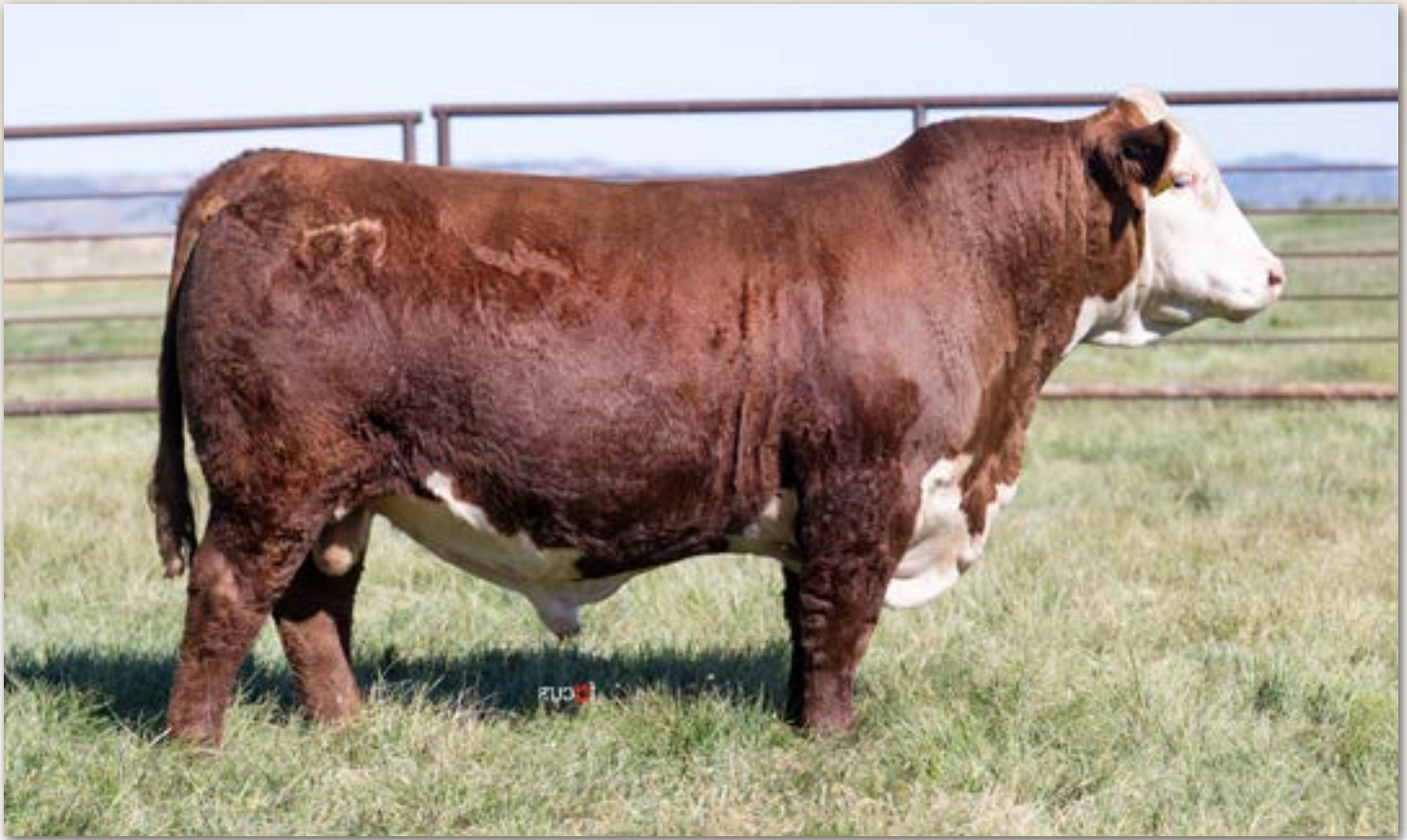
Lot 112 • PYRAMID MANIFEST 2557