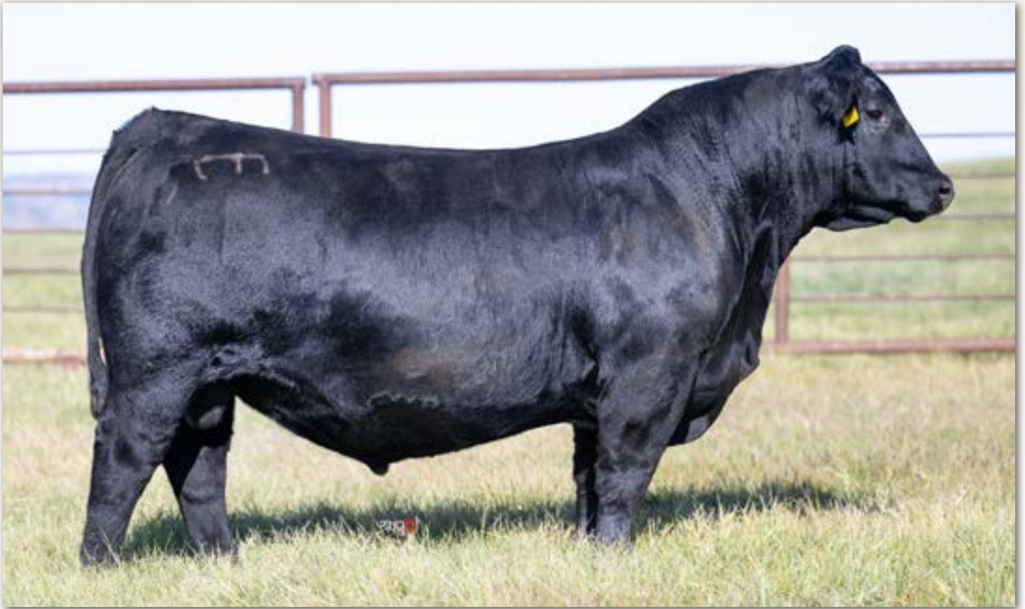
Lot 3 - Pyramid Stellar 2086