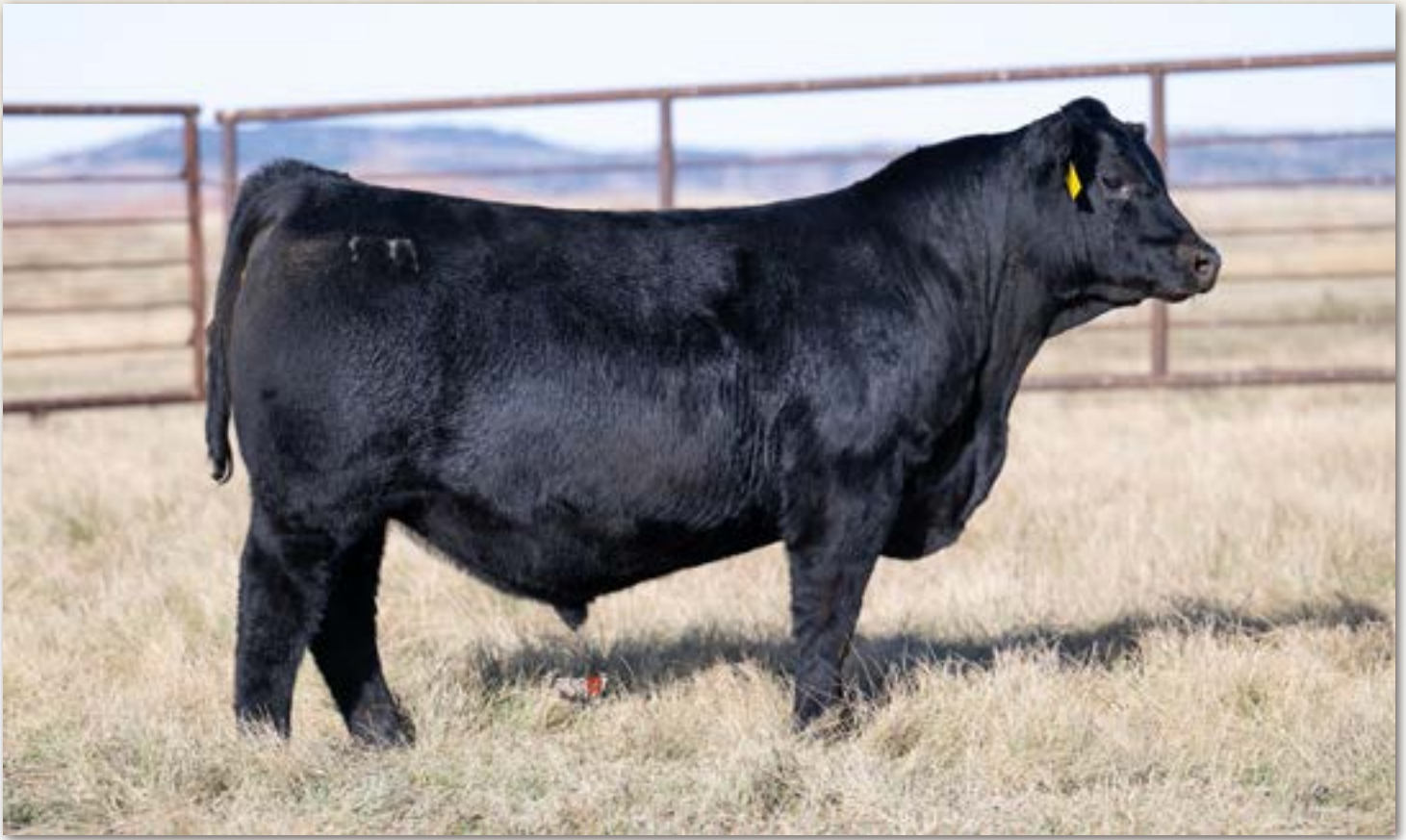
Lot 58 - FR Stellar 3010