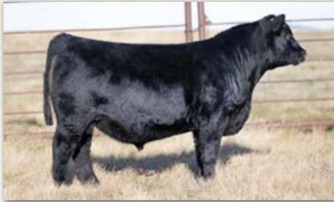
Lot 55 - FR Duke 3033