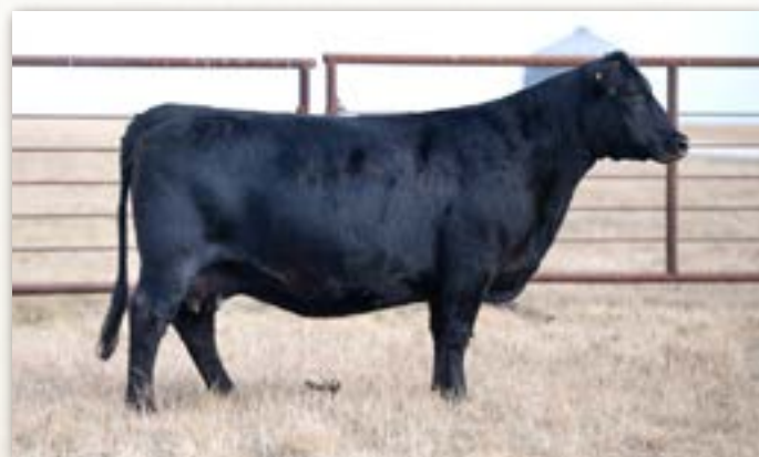
Glacial 028 Lovely 38C - Dam of Lots 3-5