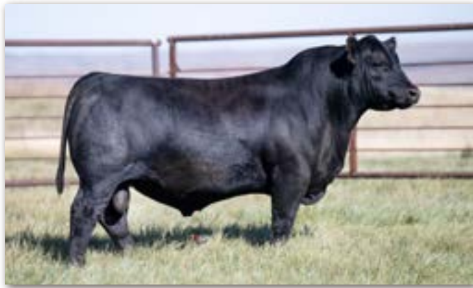
Lot 30 - Pyramid Jameson 2127