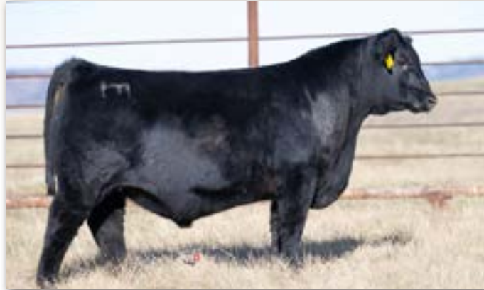
Lot 56 - FR Coal Train 3039