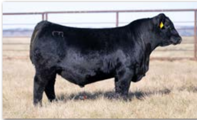
Lot 45 - FR Incentive 3032