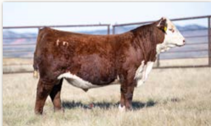
Lot 89 - FR GOLD RUSH 3531 ET