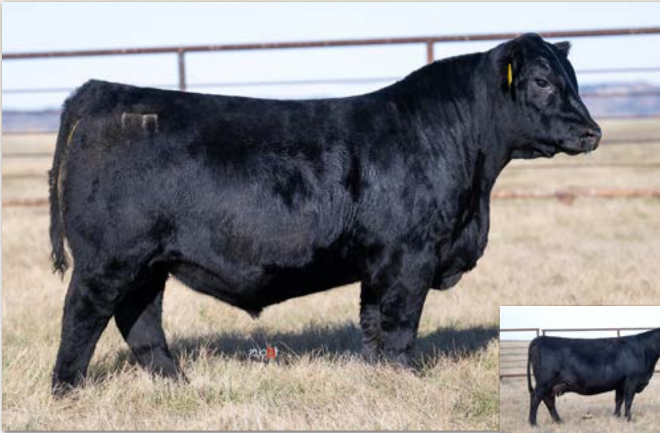
Lot 44 - FR Incentive 3005