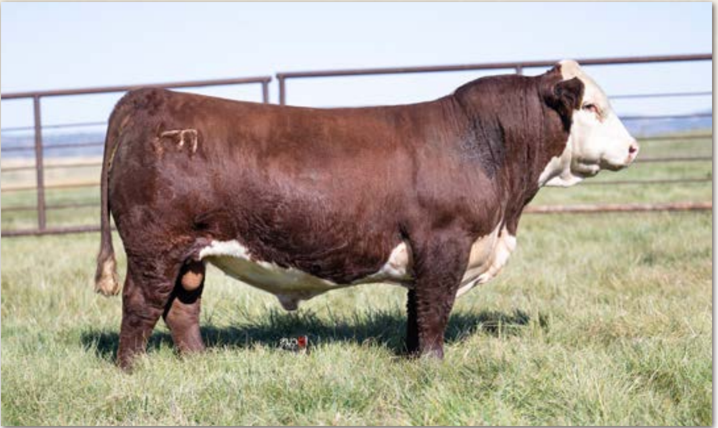
Lot 101 • PYRAMID HIGHLAND 2571