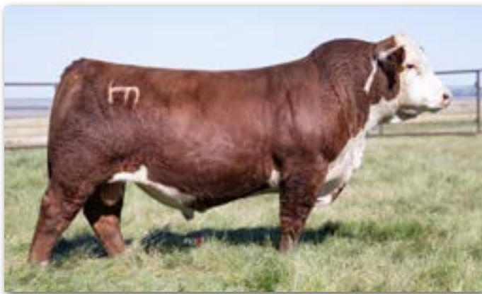
Lot 109 • PYRAMID SEWARD 2543 ET