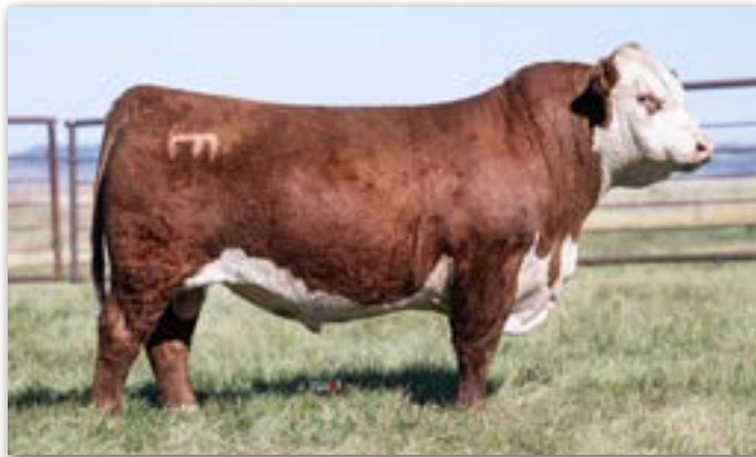
Lot 113 • PYRAMID MANIFEST 2564