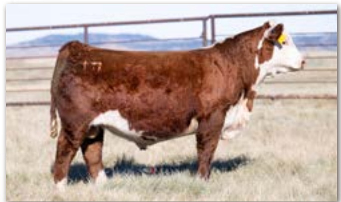
Lot 87 - FR Thomas County 3503 ET