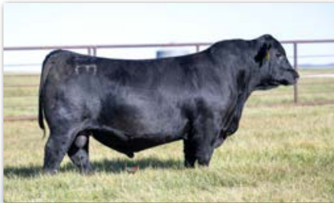
Lot 2 - Pyramid Stellar 2085

Used for natural service - Suitable for heifers