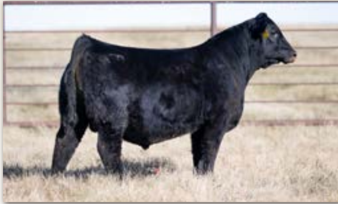
Lot 69 - FR Pathfinder 3054