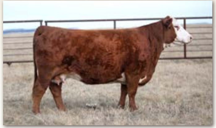
FHF 38Y RUBY 151D - Dam of Lot 90