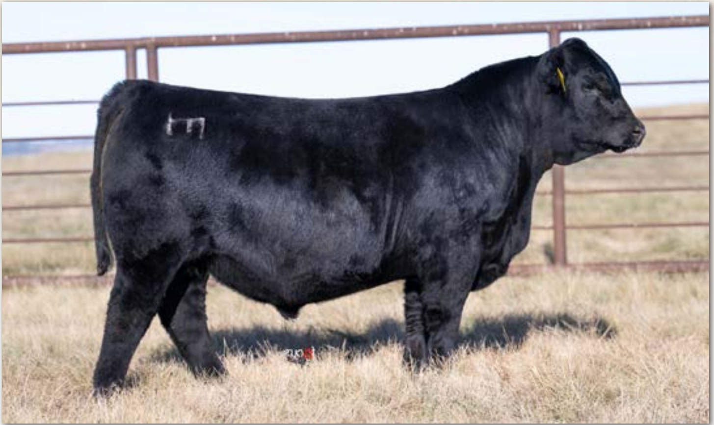
Lot 42 - FR Dignity 3021