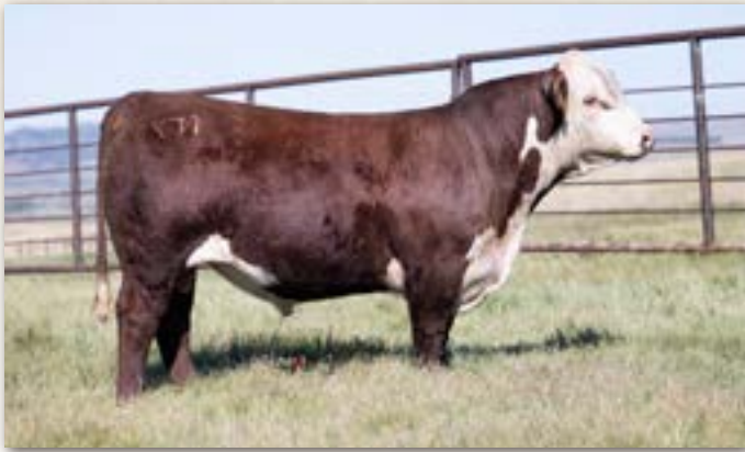
Lot 116 • PYRAMID DAYBREAK 2563