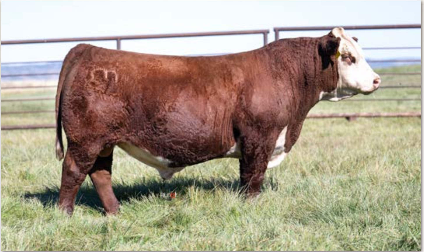
Lot 100 - PYRAMID HIGHLAND 2537