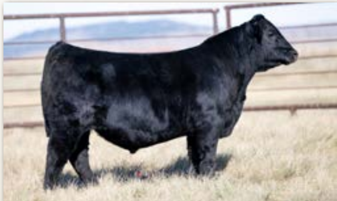
Lot 68 - FR Pathfinder 3072