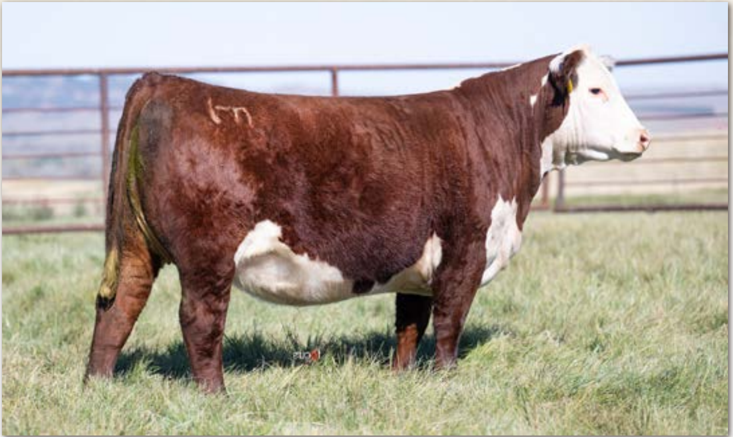
Lot 151 - FHF ILR D287 RITA 9K ET