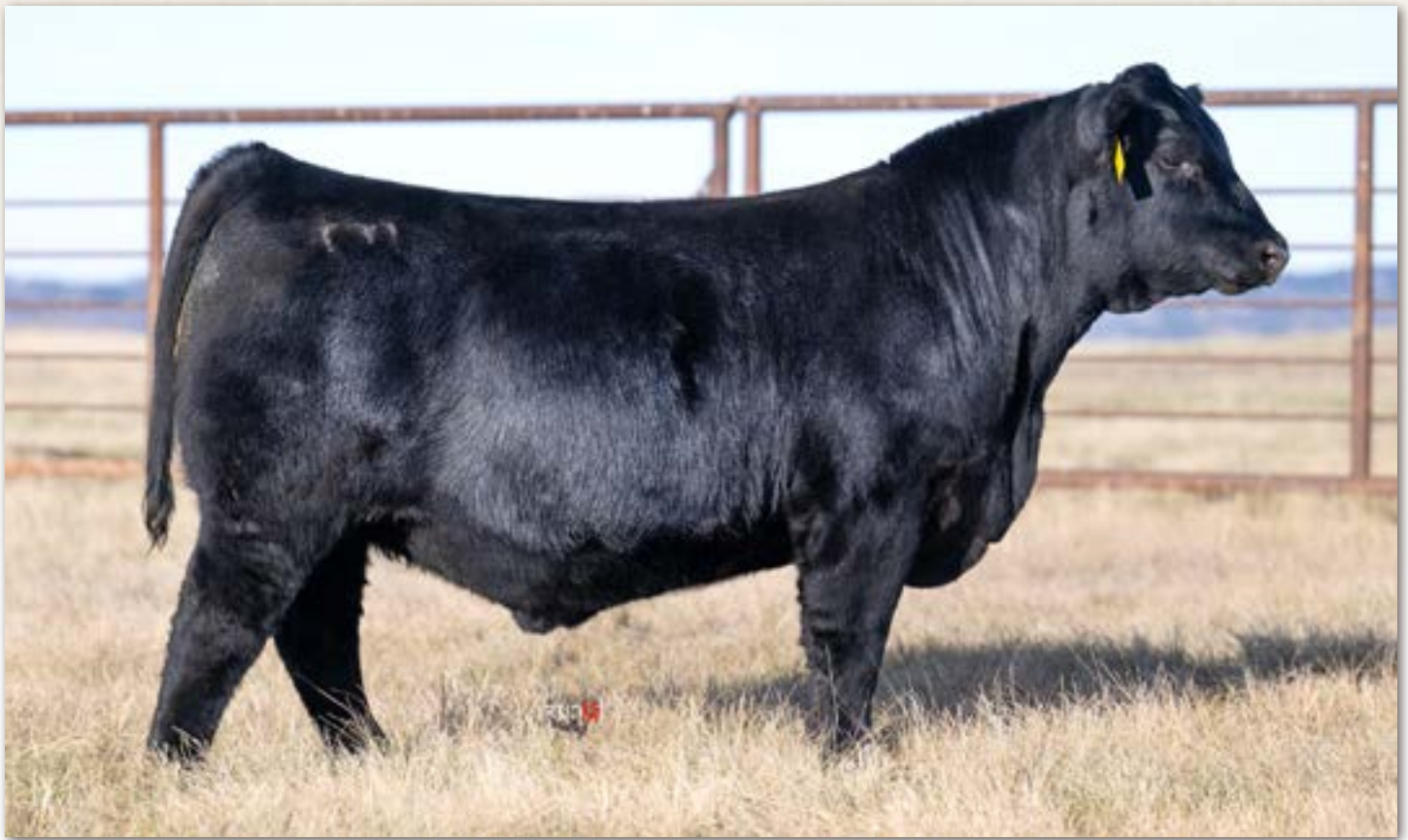
Lot 54 - FR Coalition 3013