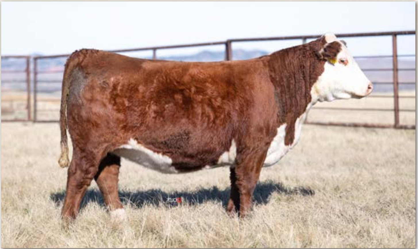
Lot 155 - FHF 84E RITA 74K