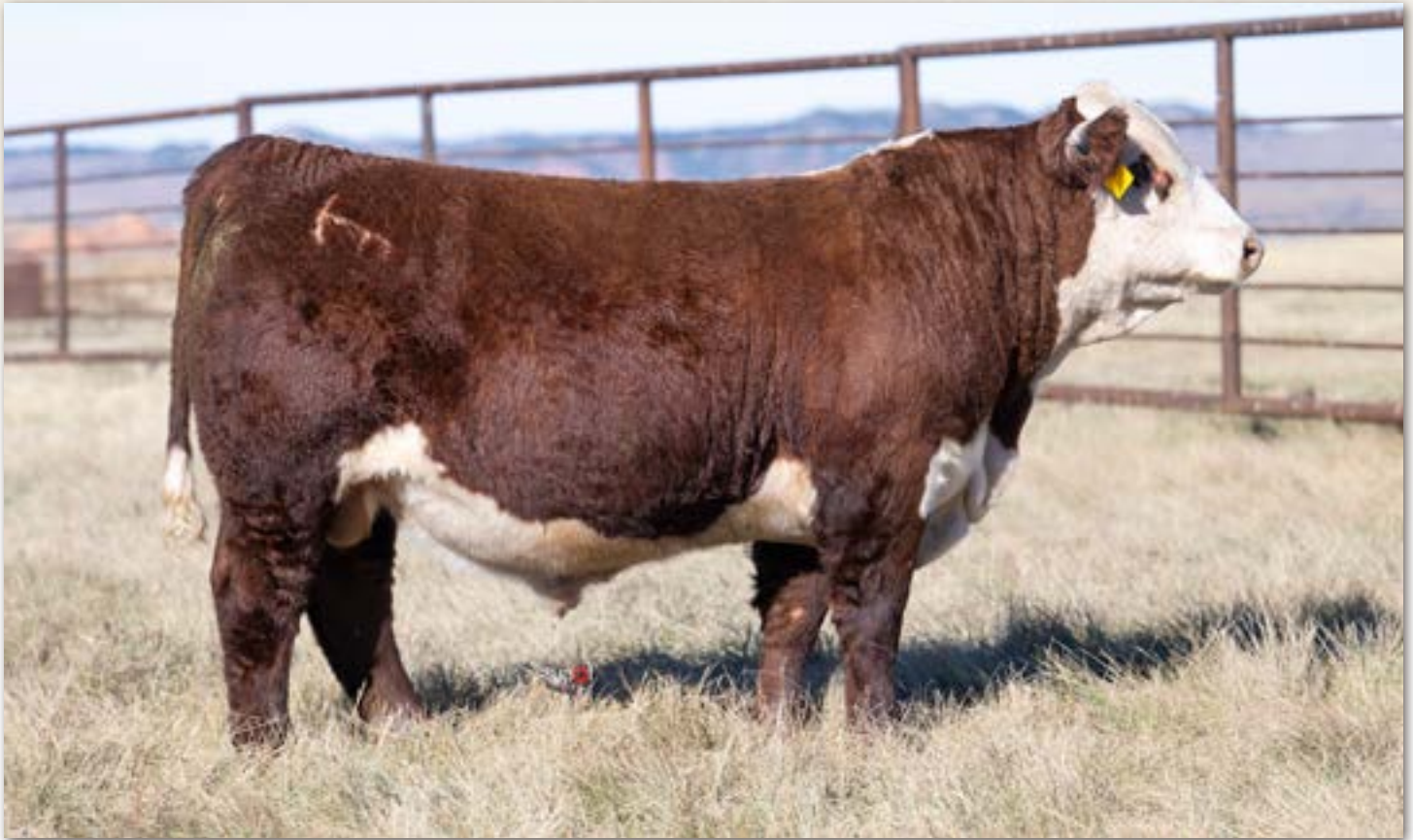
Lot 82 - FR Daybreak 3509 ET