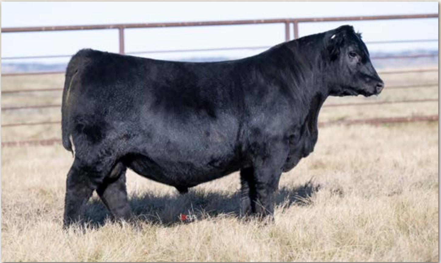
Lot 49 - FR Incentive 3017