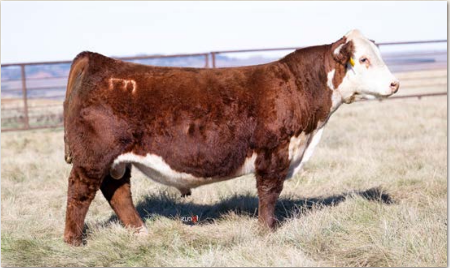
Lot 96 - FR Majestic 3516