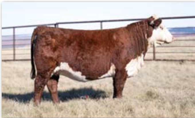
Lot 156 - FHF 84E SARAH 54K

Due March 10 to Bar JZ On Demand, Heifer Calf