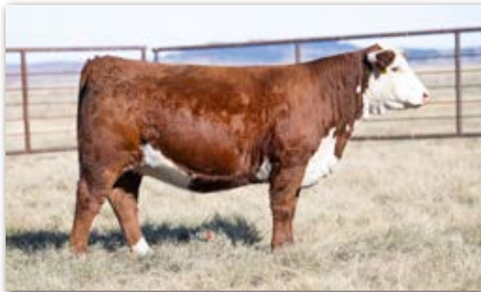
Lot 162 - FHF 84E RITA 49K

Due March 10 to Bar JZ On Demand, Bull Calf