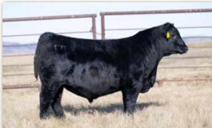
Lot 50 - FR Incentive 3004