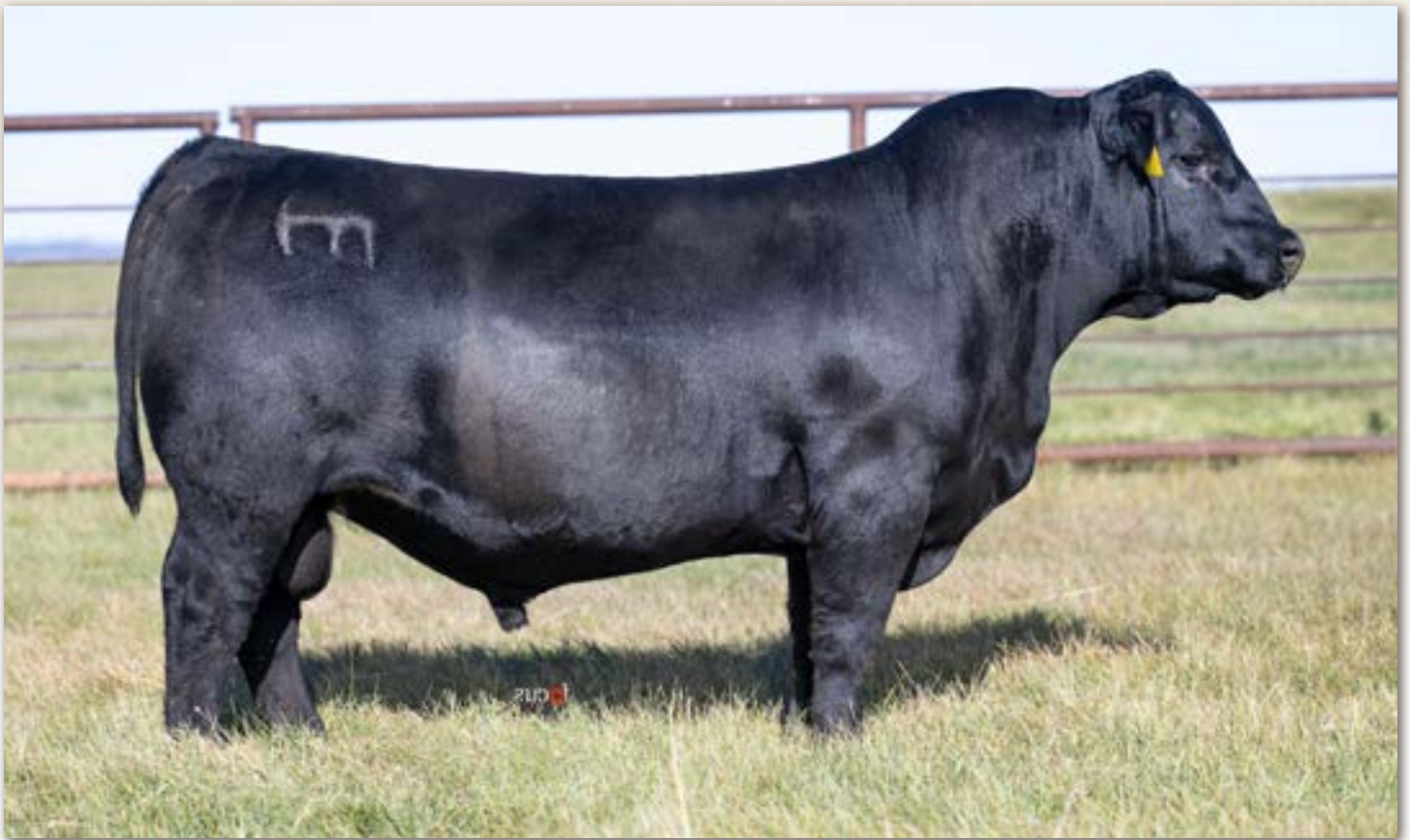
Lot 13 - Pyramid Coal Train 2102