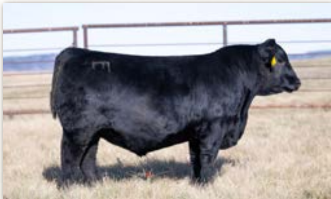
Lot 46 - FR Incentive 3031