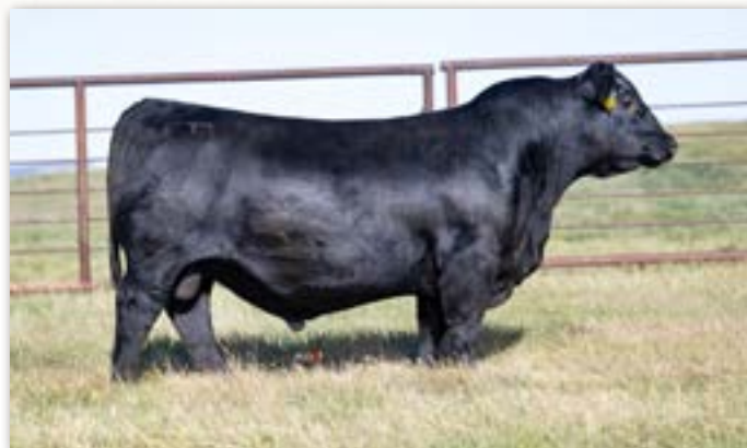
Lot 17 - Pyramid Coal Train 2125