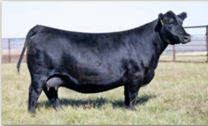
Glacial 037 Blackbird 40E - Dam of Lot 6