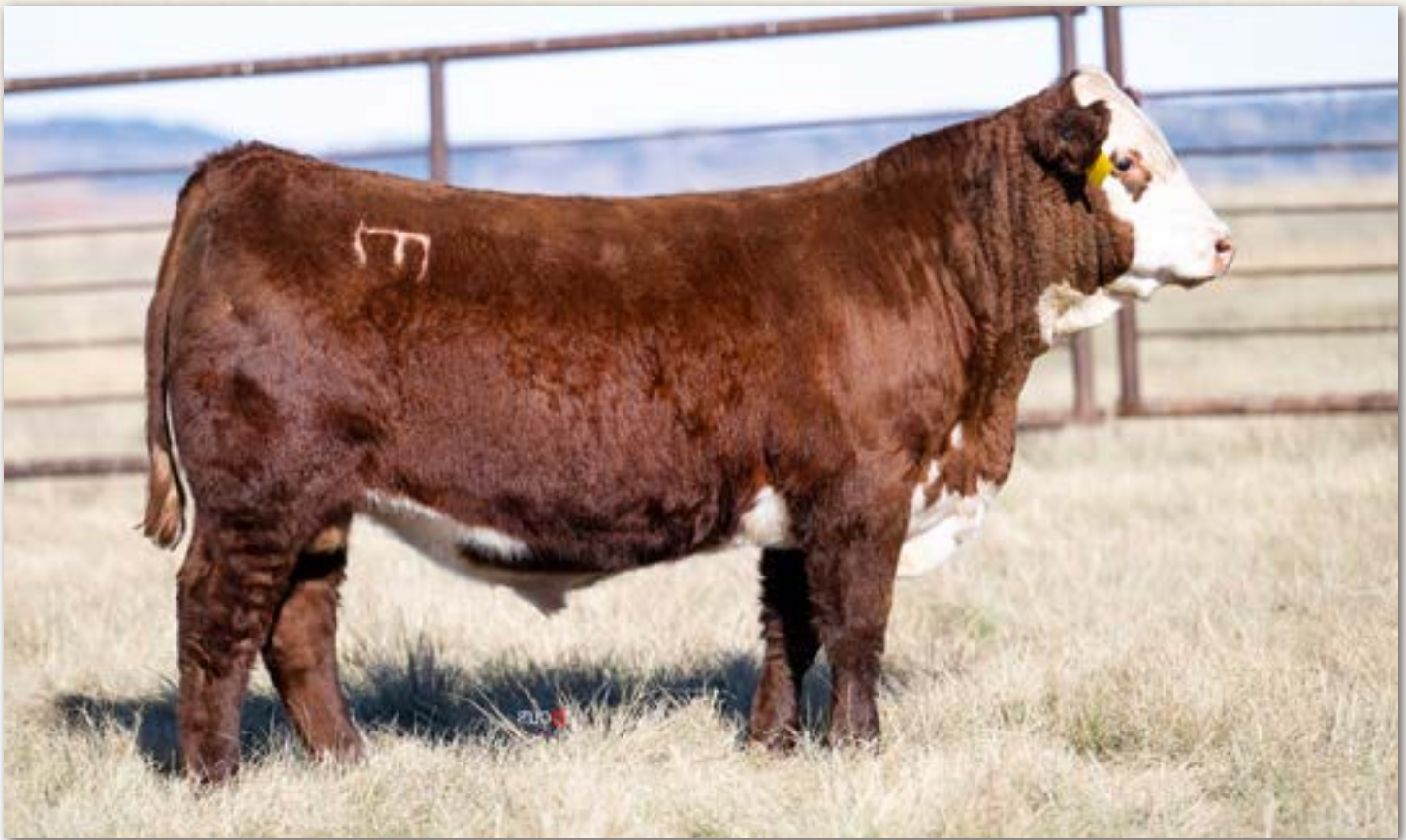
Lot 92 - FR Desperado 3504