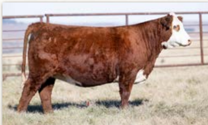
Lot 154 - FHF 0179 LYDA 57K