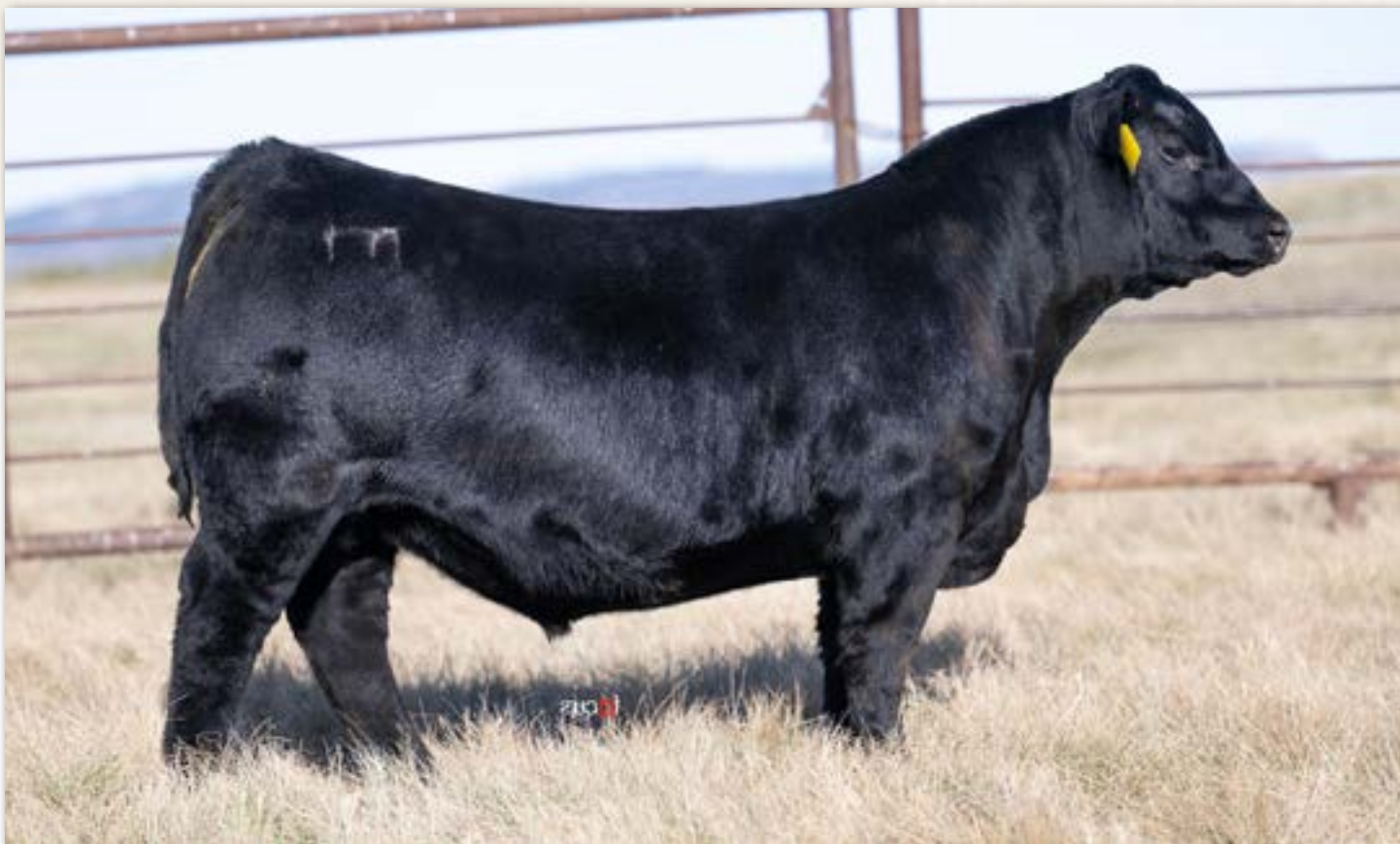
Lot 34 - FR Dignity 3019