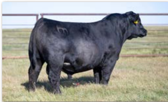
Lot 13 - Pyramid Coal Train 2102