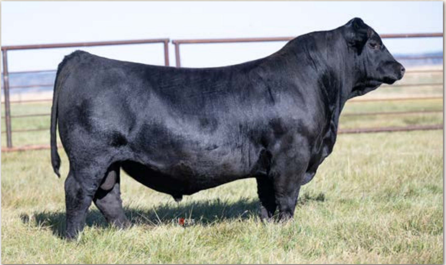
Lot 1 - Pyramid Stellar 2083