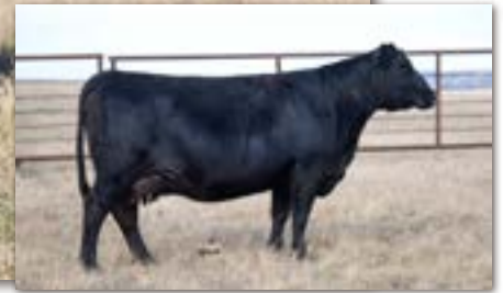
Glacial 1441 Missie 102C