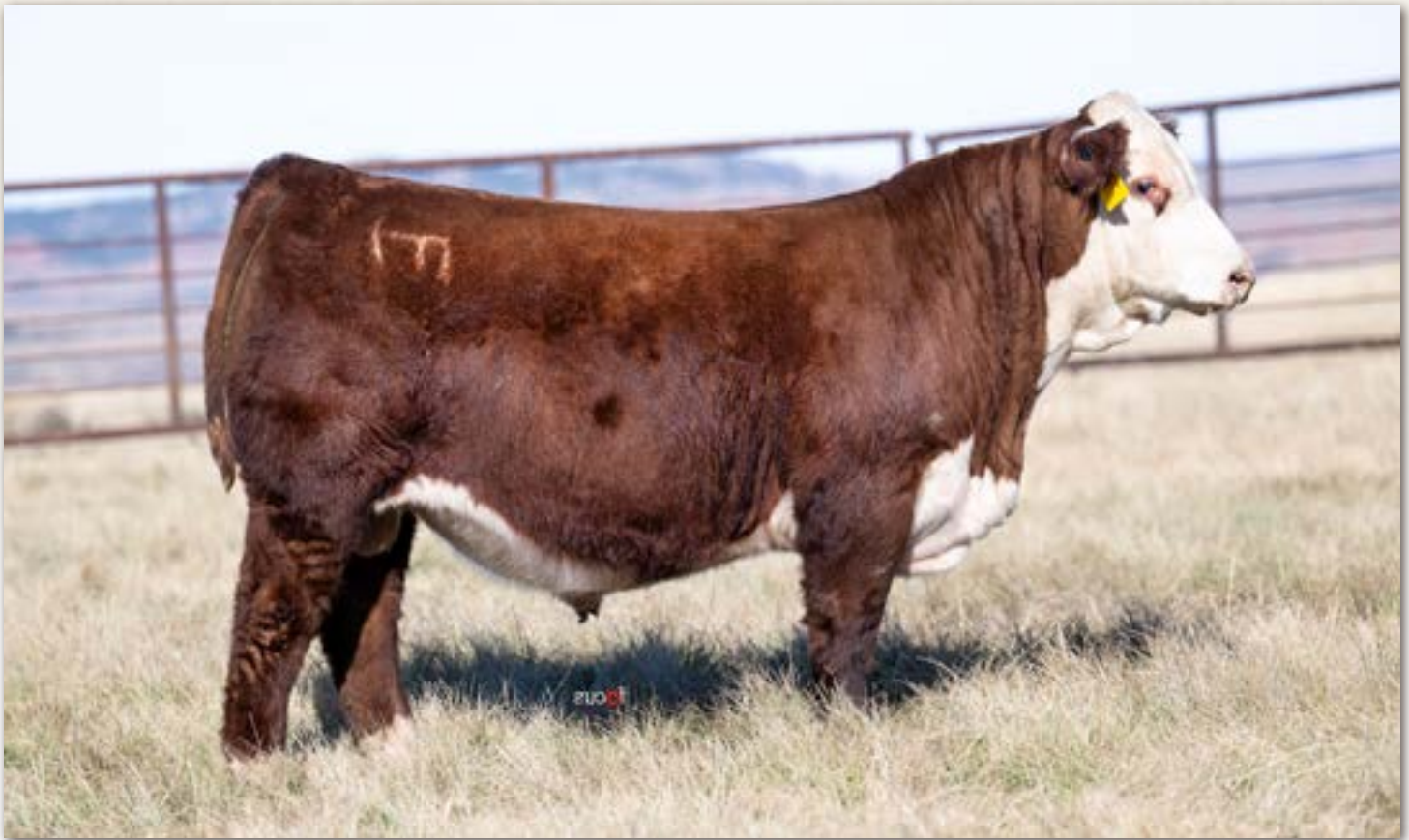
Lot 84 • FR DAYBREAK 3514 ET