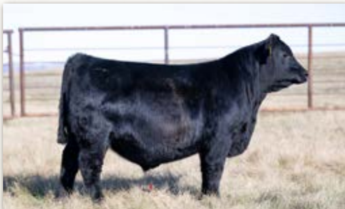
Lot 74 - FR Stellar 3043