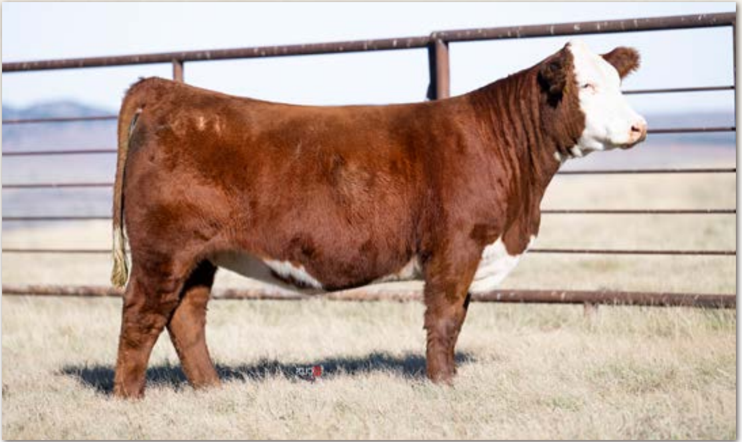
Lot 153 - FHF 0179 RITA 71K