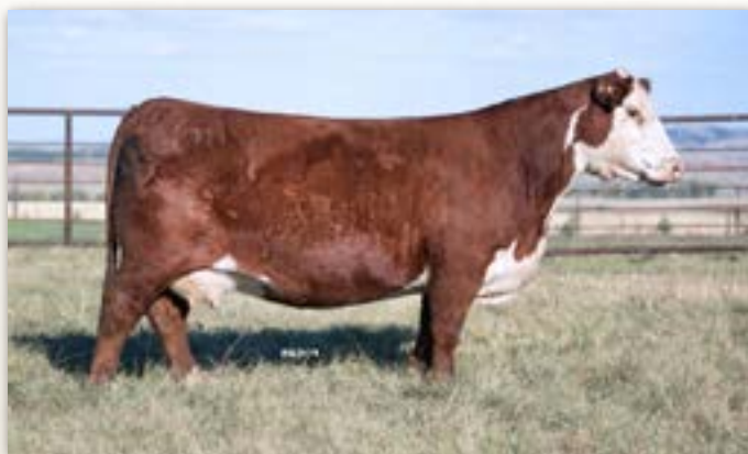
FHF 322 Rita 103E - Dam of Lots 86-88

Lots 86-88 are maternal brothers out of FHF 322 Rita a powerful daughter of Catapult 322 who records a weaning ratio of 4@103 and a yearling ratio of 3@103.