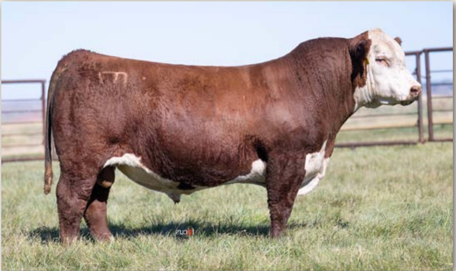
Lot 108 • PYRAMID PROMINENT 2508 ET