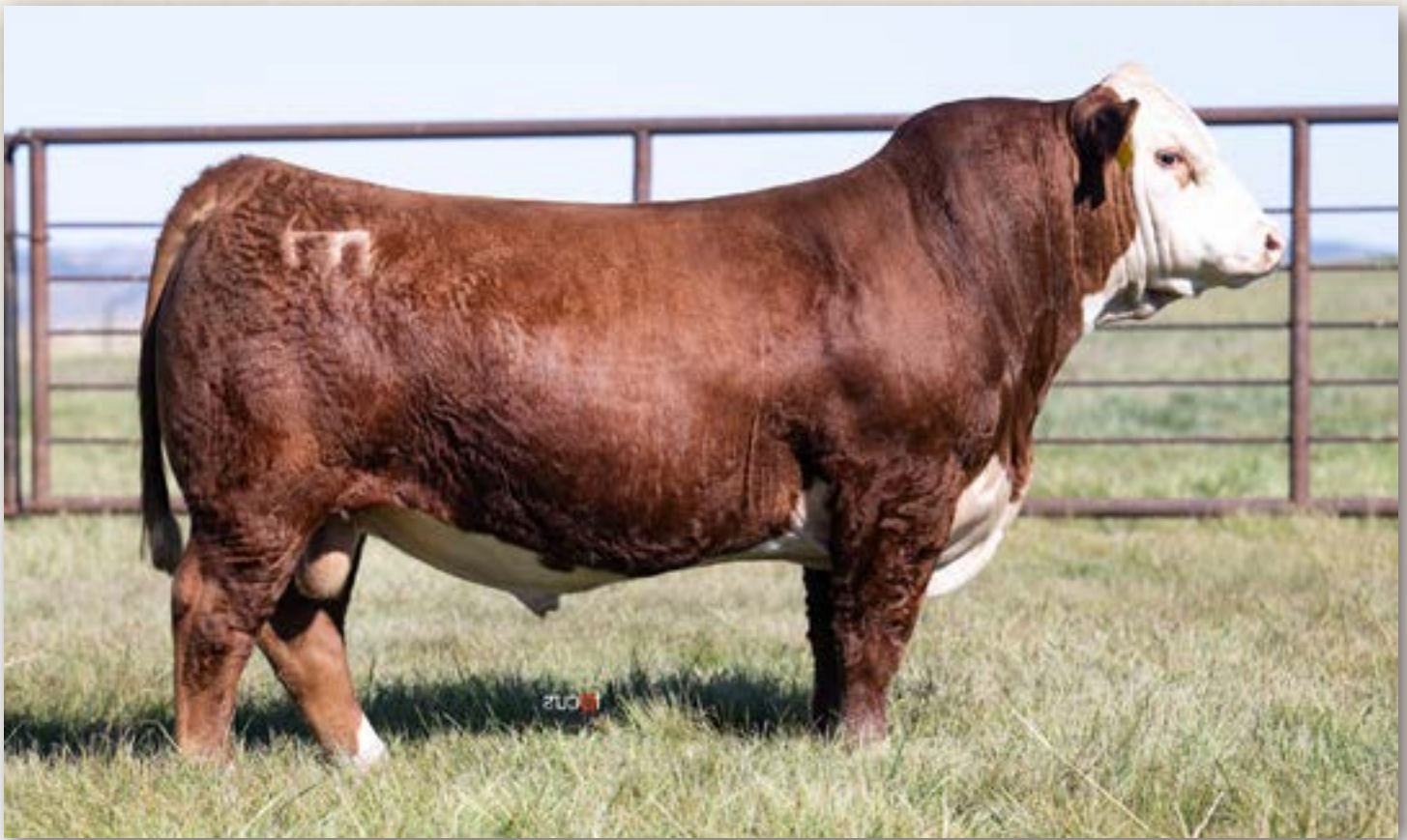
Lot 110 - PYRAMID TUFF 2566