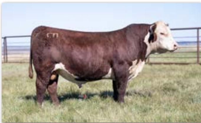
Lot 134 • PYRAMID DAYBREAK 2517 ET