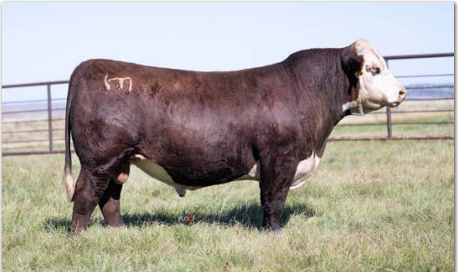
Lot 117 • PYRAMID DAYBREAK 2565