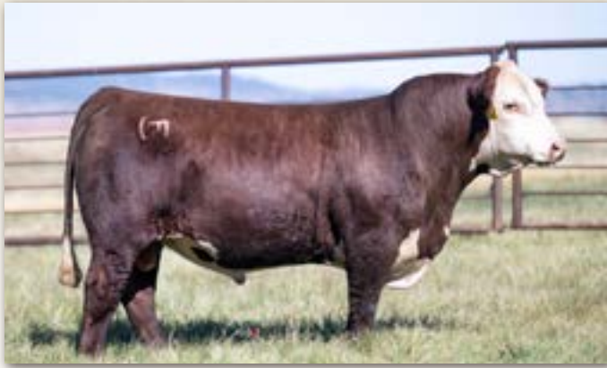
Lot 118 • PYRAMID DAYBREAK 2404