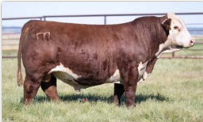
Lot 125 - PYRAMID HIGHLAND 2590