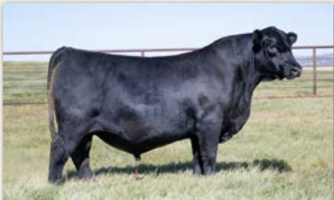
Lot 16 - Pyramid Coal Train 2088