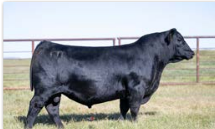
Lot 4 - Pyramid Stellar 2111