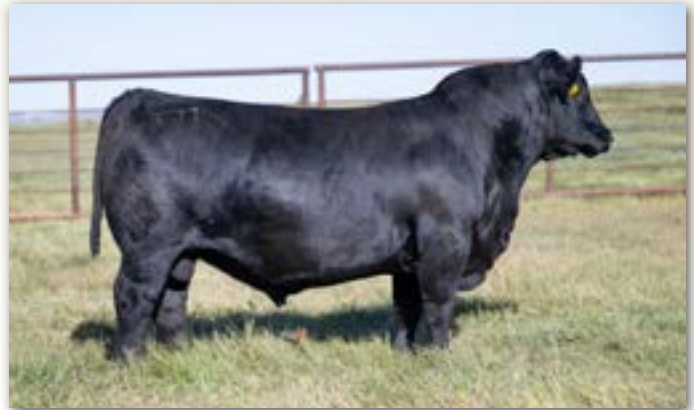
Lot 29 - Pyramid Jameson 2108

Flush brothers, Lots 27-28, out of the Glacial 25L Blackbird Eve 4D, the dam of Coalition who records a birth weight ratio of 4@97 and a weaning weight ratio of 3@109