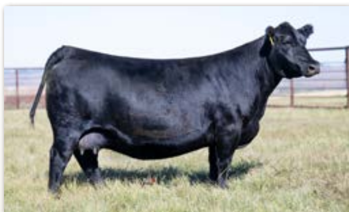
Glacial 037 Blackbird 40E • Maternal Granddam of Lots 34-35

Lot 34-35 are flush brothers out Glacial 734E Blackbird 146H is an Thunderball daughter of the great 40E cow who records a weaning weight ratio of 1@105 and a yearling weight ratio of 1@104.