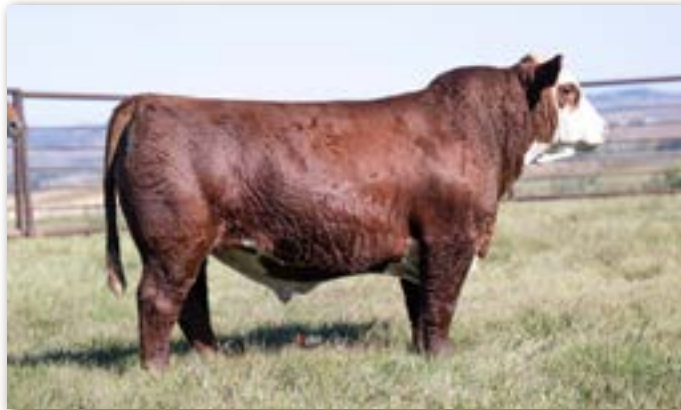
Lot 102 • PYRAMID HIGHLAND 2401