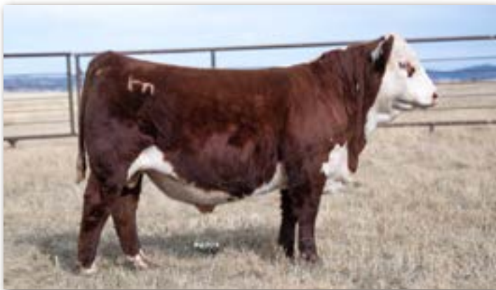
Full Brother to Lot 151 sold in last year's sale to Topp Herefords