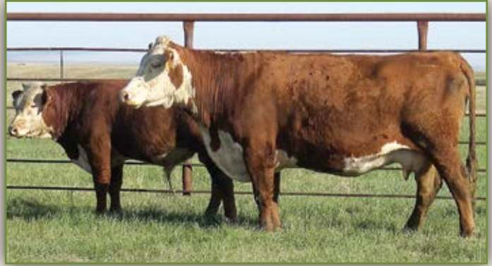
FH L1 Dominette 112. Dam of Lot 332. Grandam of Lot 2154.

Pigment LE 75% RE 100%. ET son out of 928 that was raised on a Red Angus cow. Good performance prospect out of a heavy milking cow.