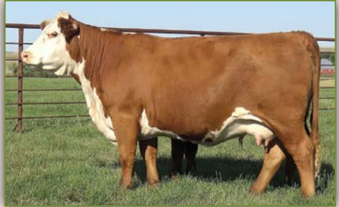
FH L1 Dominette 516 MD. Dam of Lot 2150. Grandam of Lot 2138.

Good performance record on this coming 2 year old. He is moderate in his form and thick made.