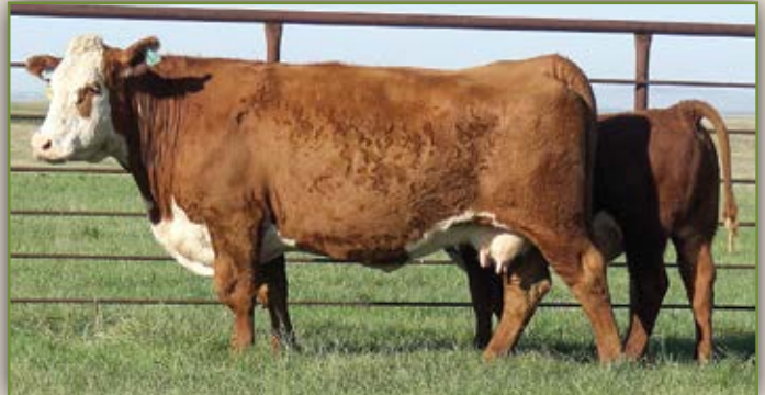
FH Navia 249 MD. Dam of Lots 330 and 331. Grandam of Lot 2133. Also the dam of 928, our home raised sire that is the sire of Lots 315, 332 and 343.

Pigment LE 20% RE 100%. Well made, soggy middled 261J son. His 9 year old dam can hold her own. She continues to be a consistent producer.