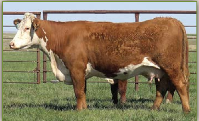
FH L1 Navita 5074. Dam of Lot 269.

Pigment LE 0% RE 100%. Thick made bull with plenty of pigment. He should sire some good crossbred calves.