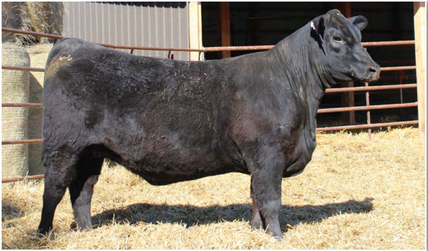
LOT 47 • MCLENNAN EVERGREEN 3214