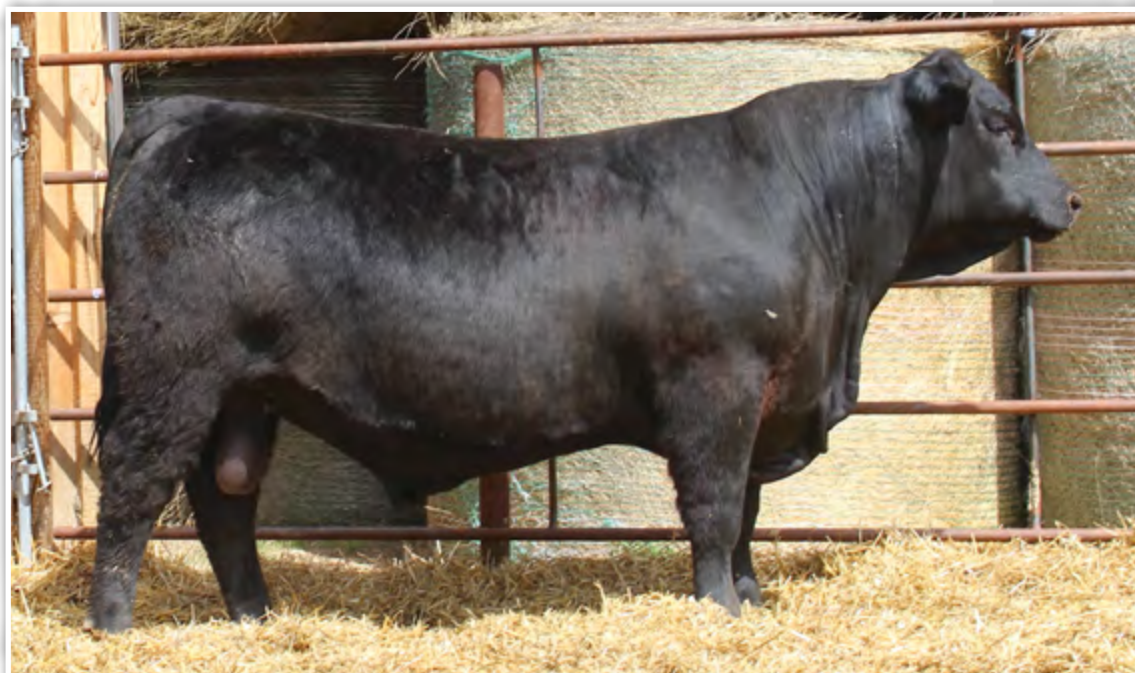
LOT 29 • MCLENNAN RINGMASTER 360