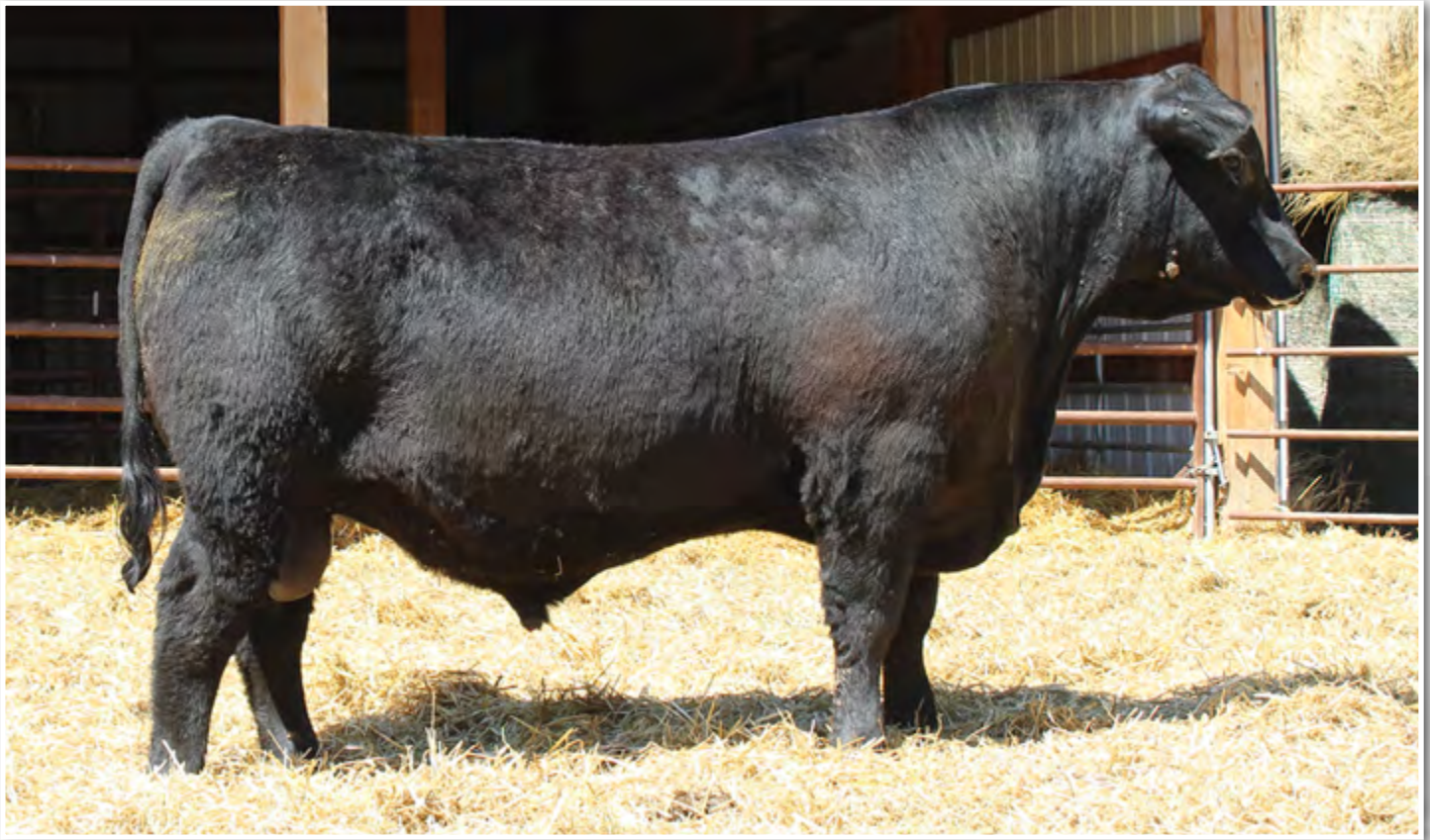
LOT 3 • MCLENNAN SHOWMAN 310