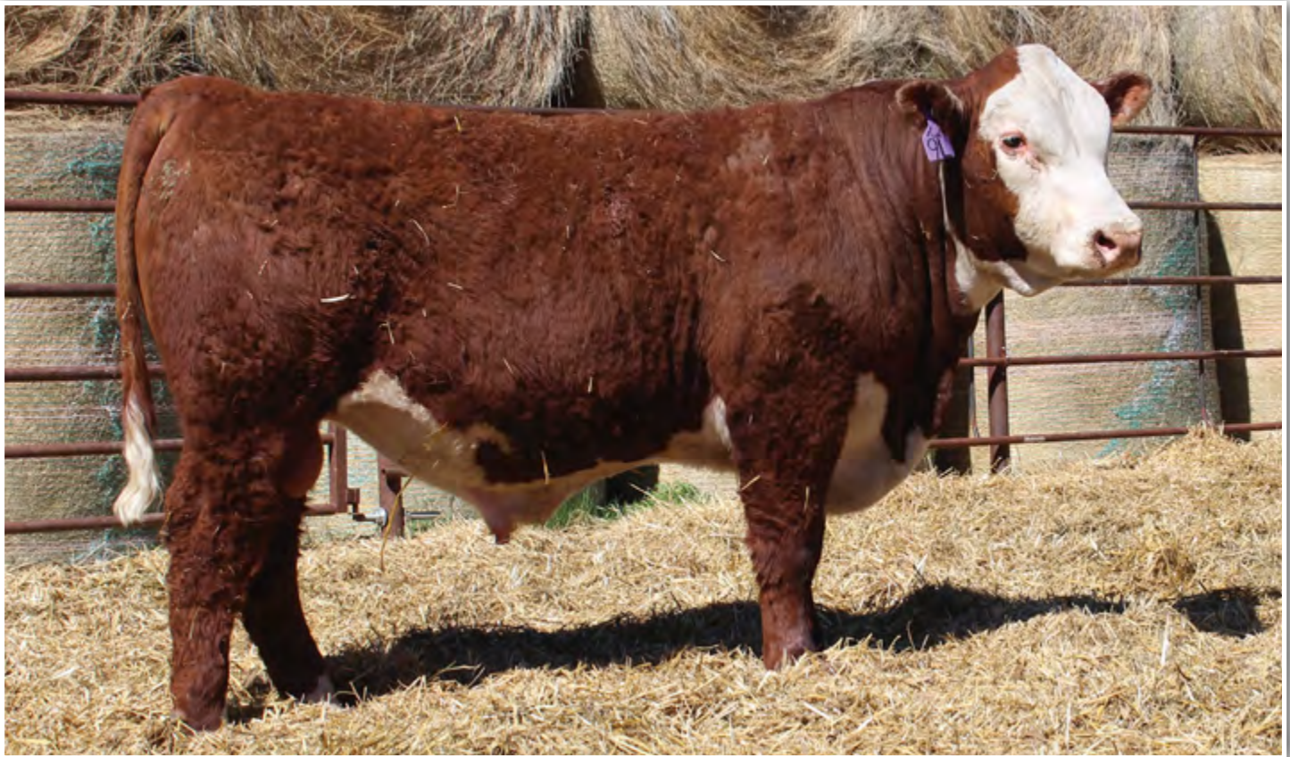
LOT 43 • MCLENNAN 11F LINCOLN 9L ET