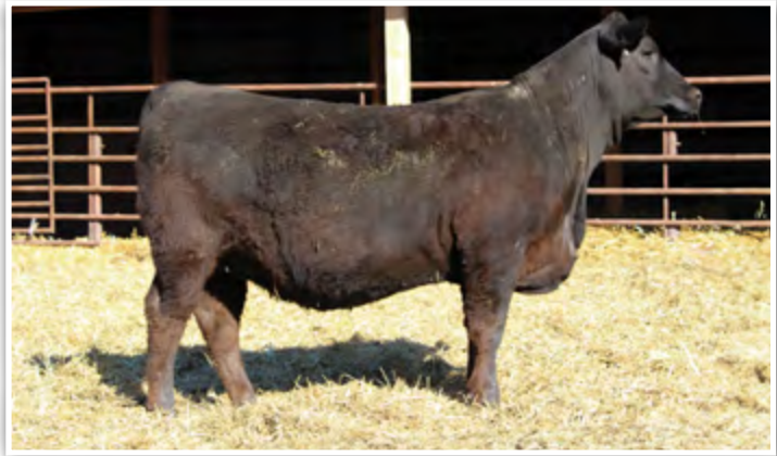
LOT 48 • MCLENNAN EVERGREEN 3216