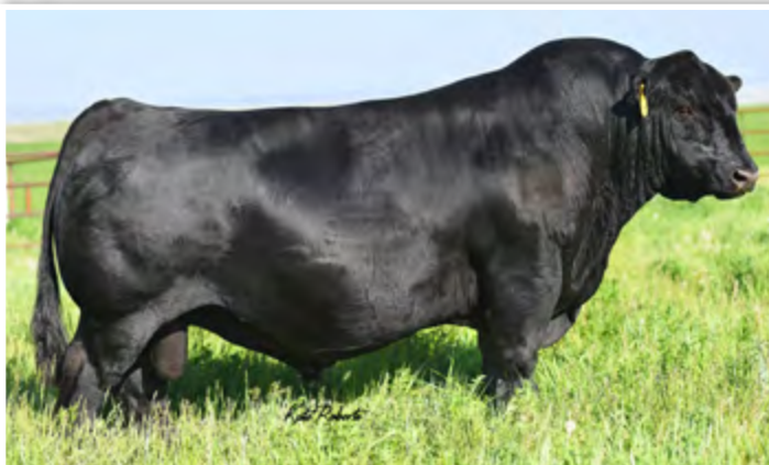
RAVEN POWERBALL 53 • SIRE OF BAR 69 RINGMASTER 8002