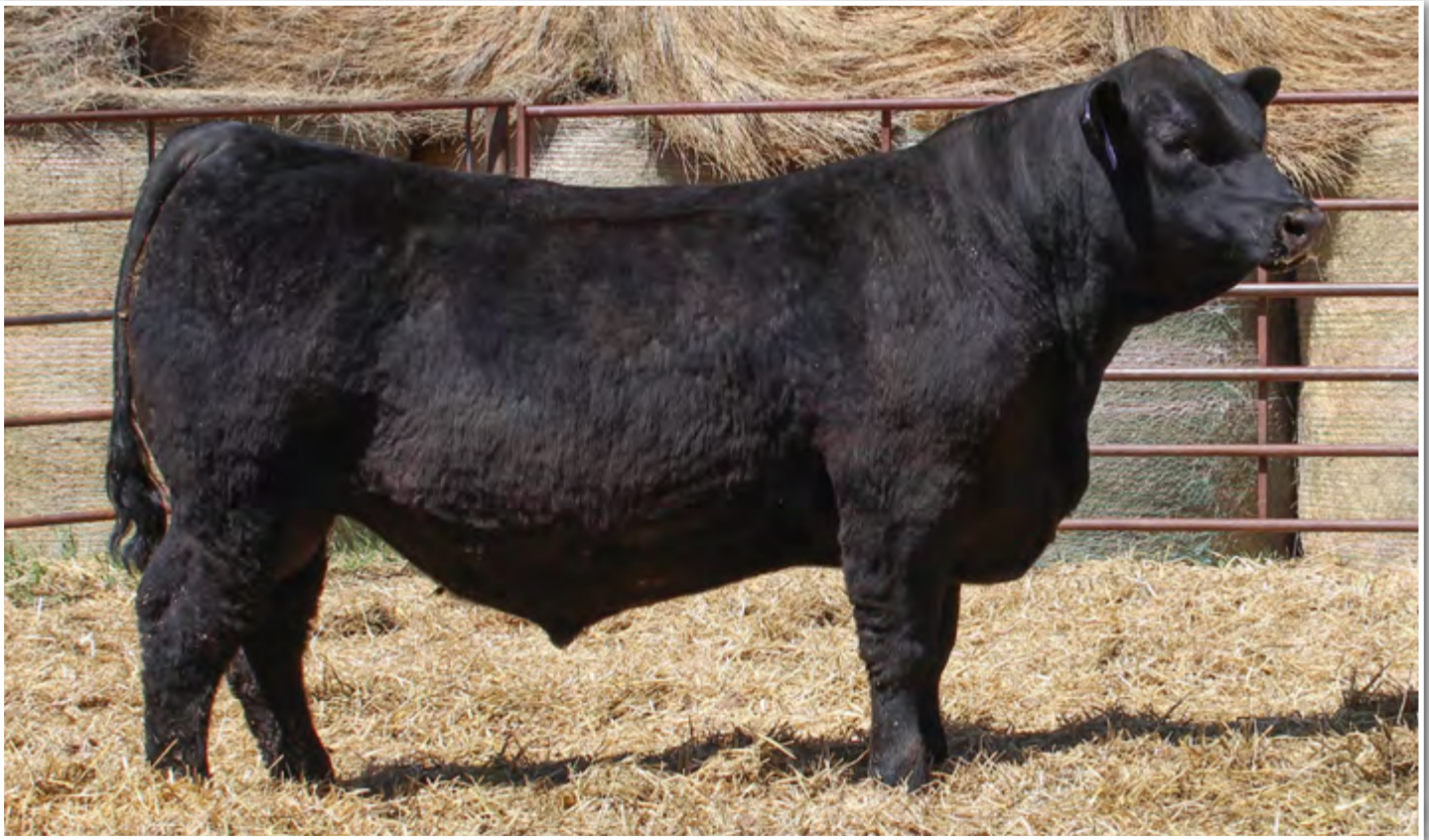
LOT 1 • MCLENNAN SHOWMAN 3219

ABOUT THE OFFERING: This offering consists of our second large group of progeny produced through the use of embryo transfer. We were able to flush successfully 7 donor cows that have a long and proven track record in our program and environment. We opted to flush all the donors to Shiefelbein Showman 338 after seeing the bull as a yearling and more importantly researching his progeny at a couple of very reputable operations. The bull complemented our group of donors in tremendous fashion with consistent results on both the bull and heifer calves. The calves started light, but, took shape rapidly and weaned heavy. The Showman progeny are thick made, very sound cattle that possess a very eye appealing phenotype that is very repeatable for both bulls and heifers. Uniquely, for a bull that excels for growth, a high percentage of the bulls are more than suitable for use on heifers. Cattlemen will appreciate their masculinity, boldness of rib and natural fleshing ability. They should be an excellent breeding choice for operators looking to power up their calf crop but also keep a high percentage of high quality replacement females.