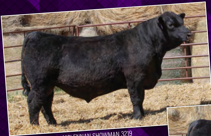
LOT 1 • McLENNAN SHOWMAN 3219