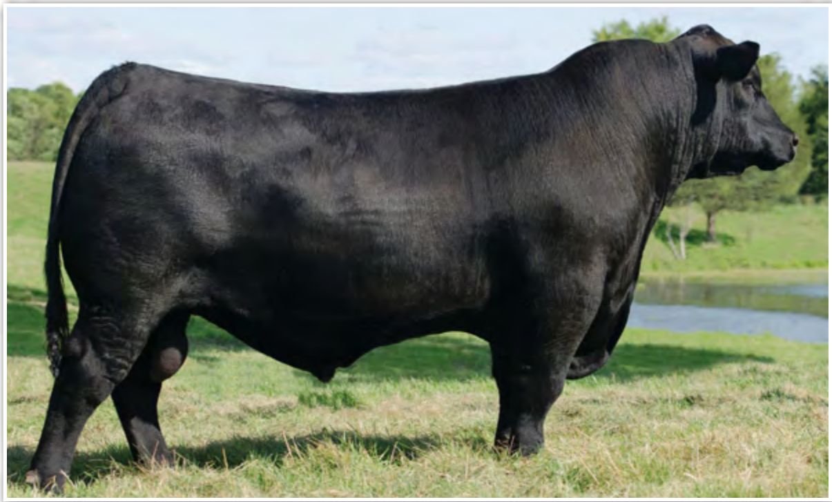
SCHIEFELBEIN SHOWMAN 338