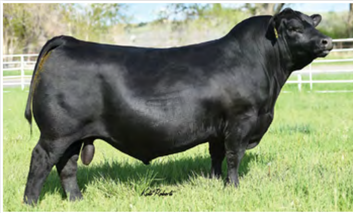
S ARCHITECT 9501