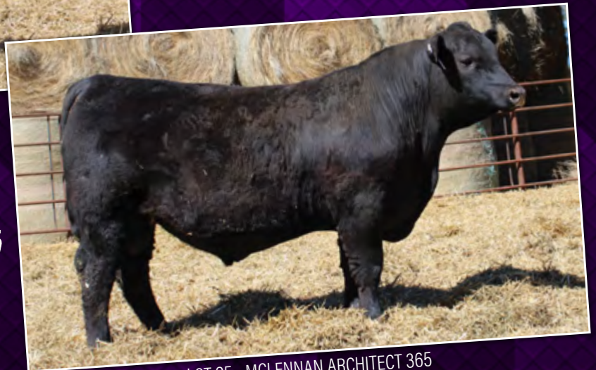
LOT 25 • McLENNAN ARCHITECT 365

Including 30 ET sons and daughters of Schiefelbein Showman 338