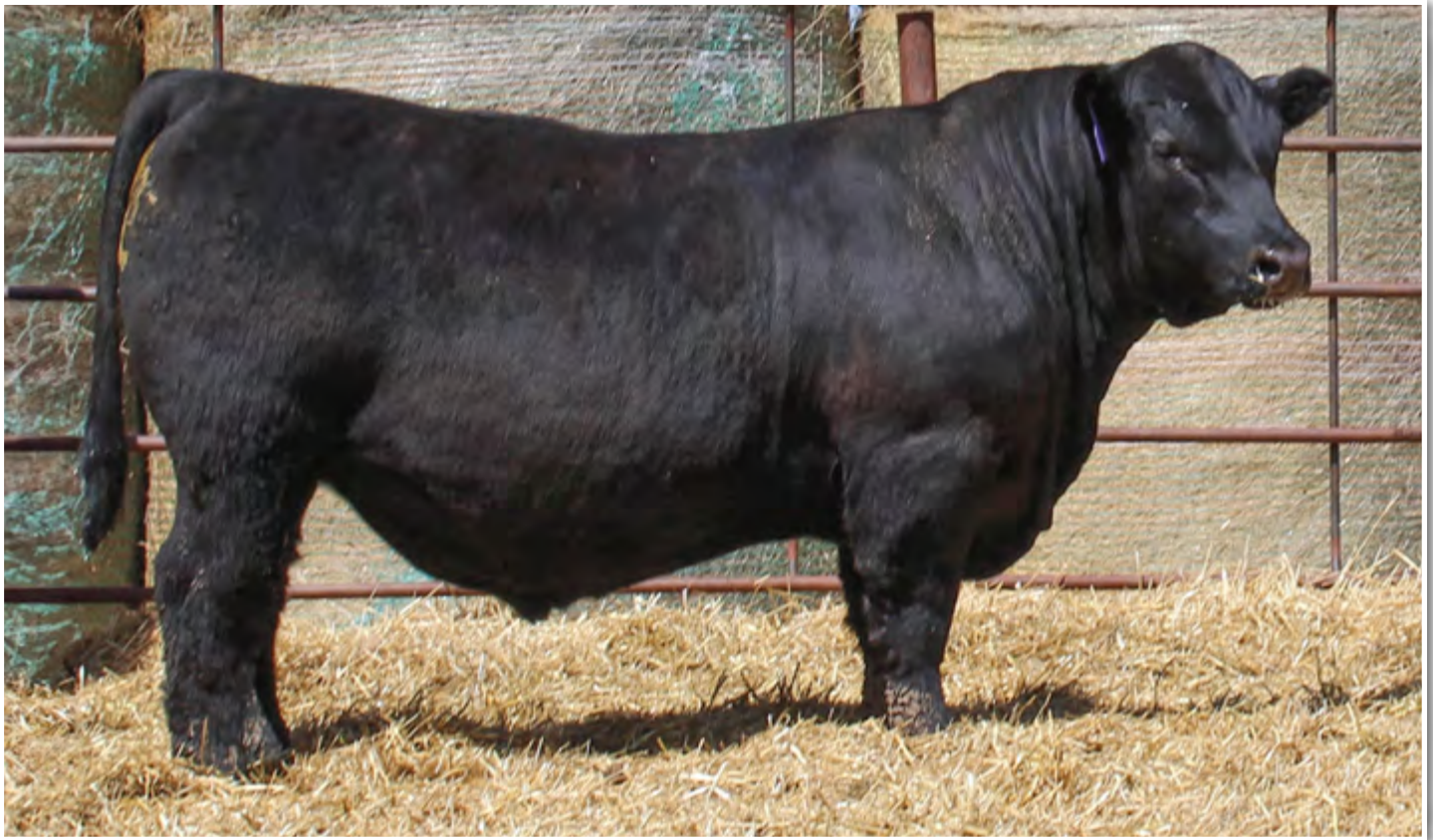
LOT 40 • MCLENNAN RAINFALL 384