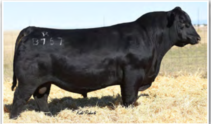
TEHAMA TAHOE B767