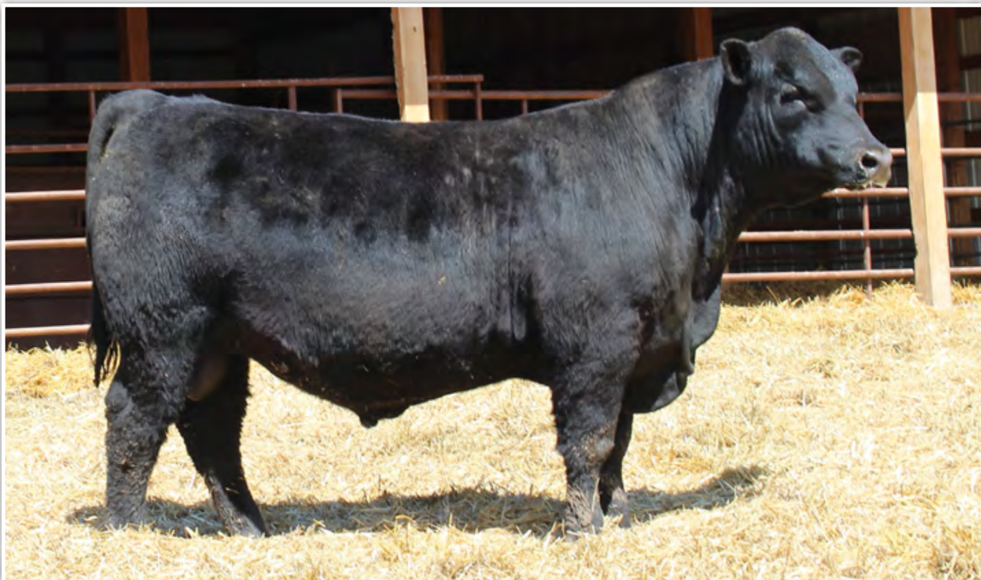
LOT 20 • MCLENNAN SHOWMAN 3226