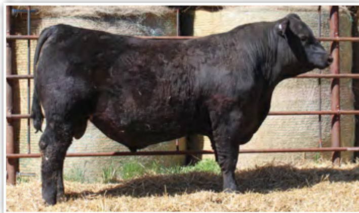
LOT 27 • MCLENNAN ARCHITECT 364