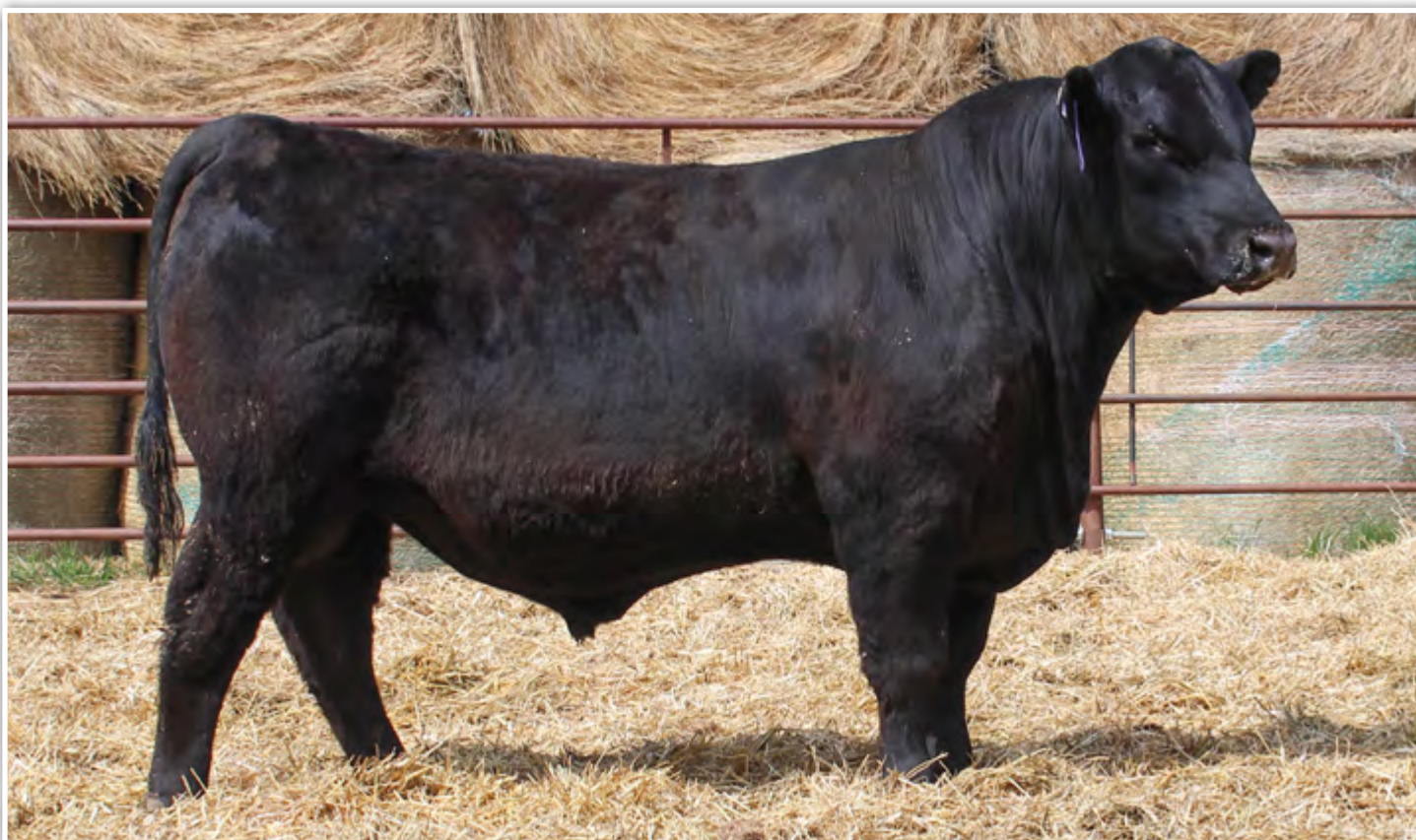
LOT 12 • MCLENNAN SHOWMAN 318