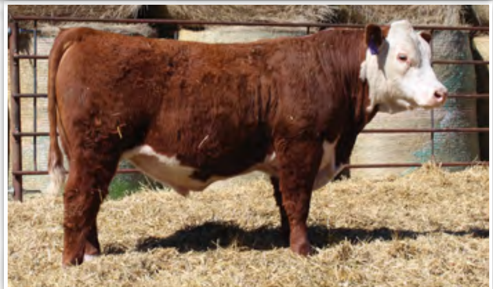
LOT 44 • MCLENNAN 11F LINCOLN 10L

TH 122 71I VICTOR 719T JDH MS YANKEE 11U ET BAR JZ RUMBLE 525X AH JDH MS 25L WRANGLER 34X ET NJW 98S R117 RIBEYE 88X ET WLL ZOEY 3Z (WLL3Z) UPS DOMINO 3027 (3027) FHF 15X ACHIEVA 195B