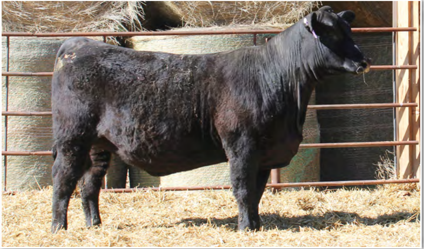
LOT 56 • MCLENNAN QUEEN MOTHER 306