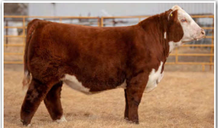
JDH AH LINCOLN 10611 ET