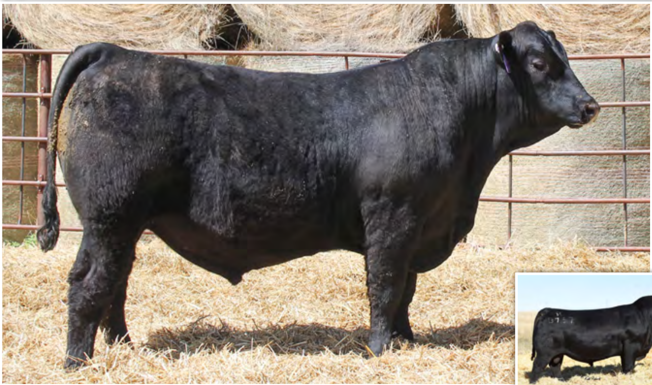
LOT 22 • MCLENNAN TAHOE 302

TEHAMA TAHOE B767: (Pictured above) We utilized this great herd sire as an outcross option on a group of early calving heifers with great success. Tahoe's progeny are very consistent and have provided customer satisfaction for a number of years across the country. His sons and daughters in this offering are thick made, high volume cattle that weigh heavy and are sound and gentle. His daughters are known to be outstanding, productive cattle.