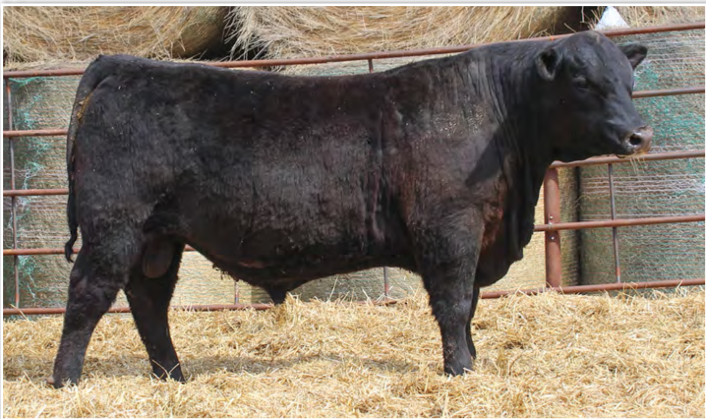
LOT 7 • MCLENNAN SHOWMAN 3218