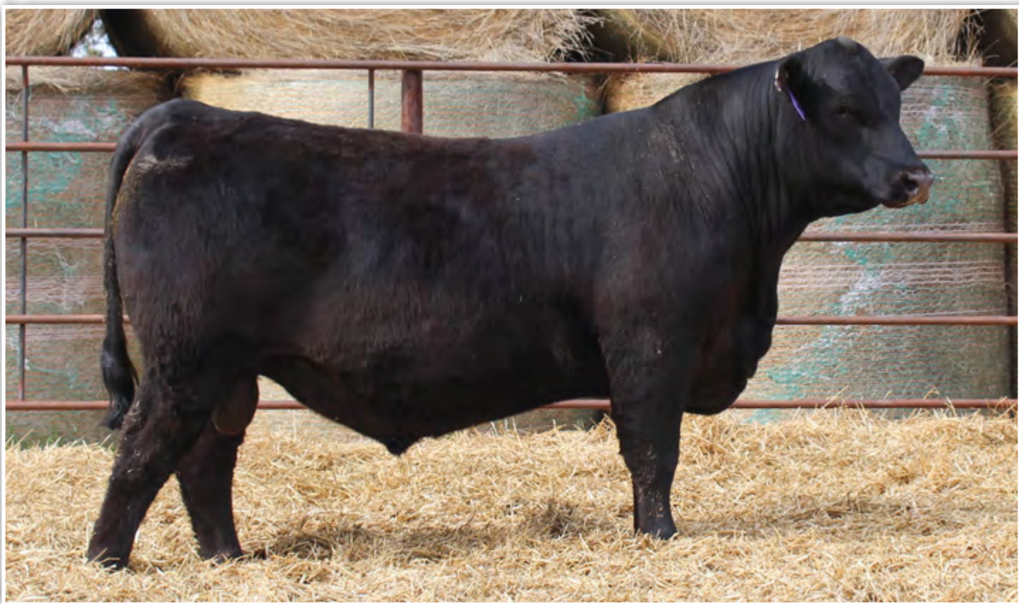
LOT 15 • MCLENNAN SHOWMAN 3223