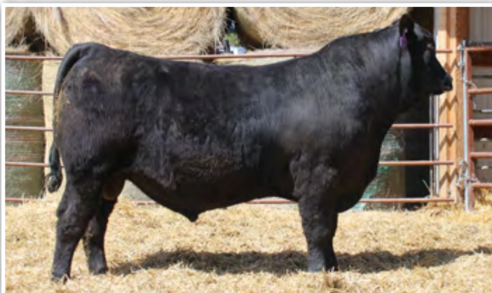
LOT 23 • MCLENNAN TAHOE 304