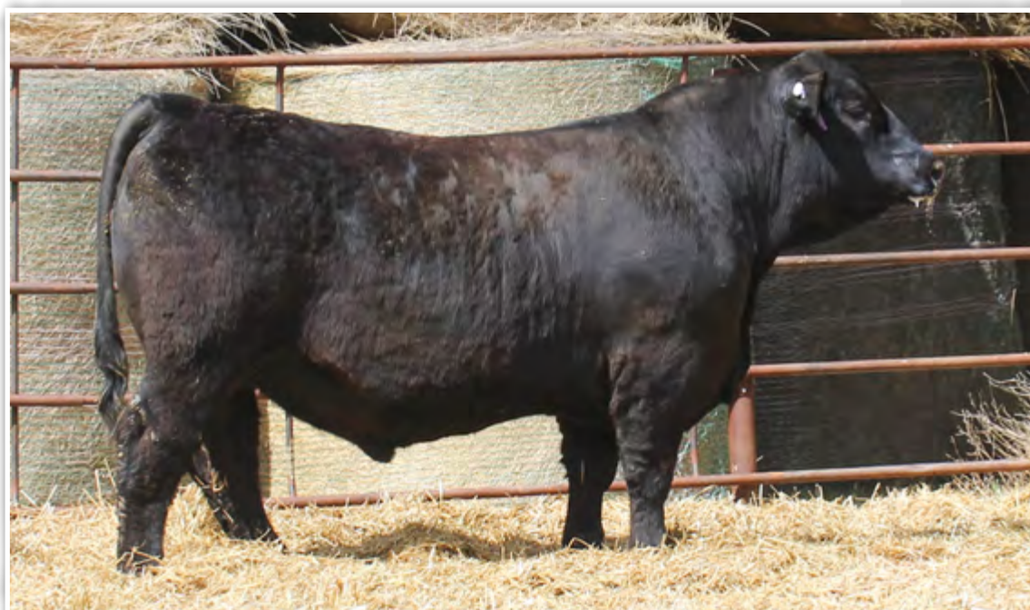
LOT 30 • MCLENNAN RINGMASTER 356