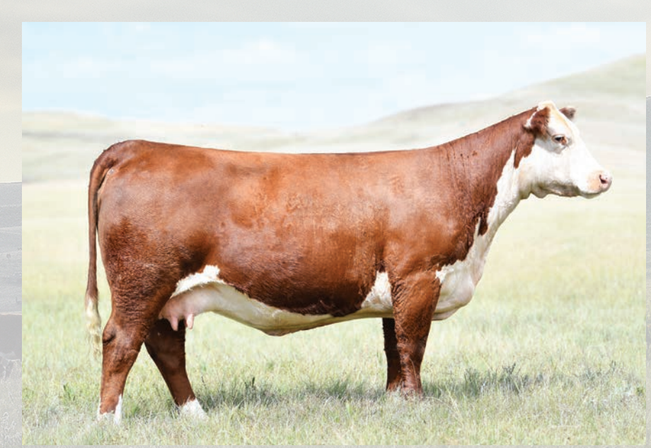
ECR Lady Flow 211 ET :: Dam of Lots 1 & 2