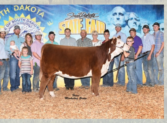
ECR 2296 Bobbi Sue 7789 ET Grand Champion Female, 2018 SD State Fair Hereford Special Full sib to Lots 1 & 2