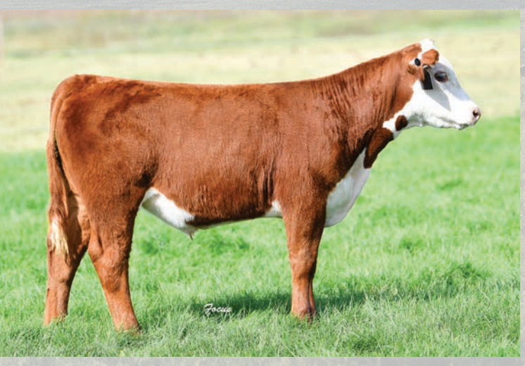
Lot 39 Steer

This steer has been a standout since early on. Has plenty of muscle and shape. Will be very competitive in SD Hereford special or any other state fair.