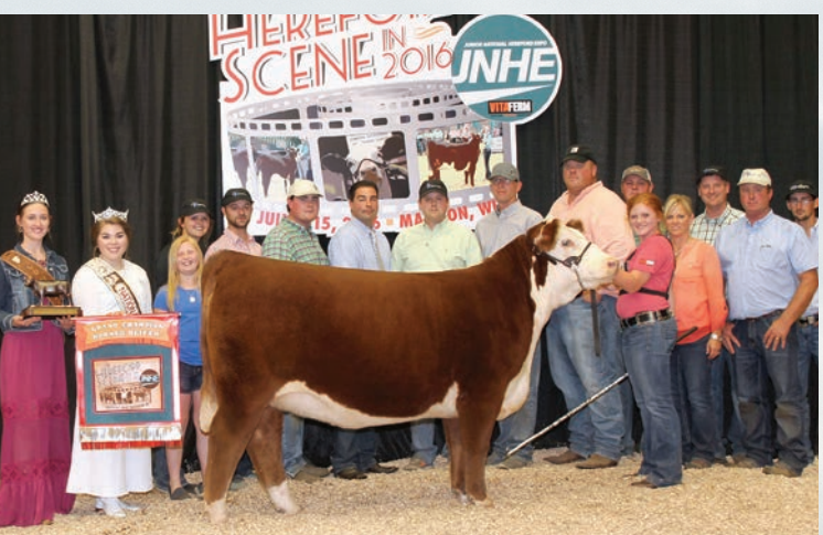
ECR Candi 5451 ET :: Dam of Lot 5