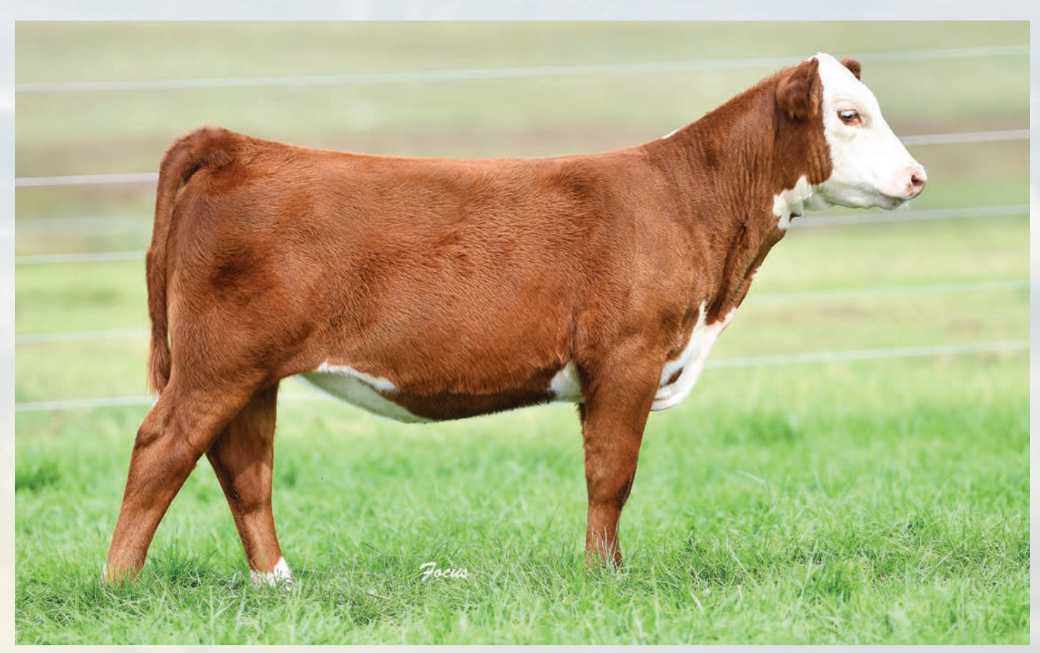
ECR WF 2296 Miss Donna 9909 ET :: Lot 3