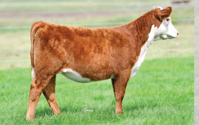
ECR 7076 Misty 9327 :: Lot 34