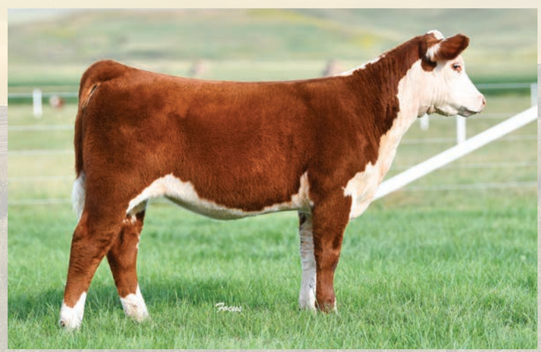
ECR ATM Georgia Girl 9272 :: Lot 18