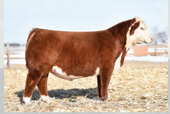
ECR Shameless 7586 ET :: Full sib to Lots 21-27

OCC Lady Cash 512 ET Full sib to Lots 21-27 Grand Champion Polled Female 2016 JNHE Supreme Champion 2017 San Antonio Stock Show Grand Champion Female, 2017 Houston Livestock Show