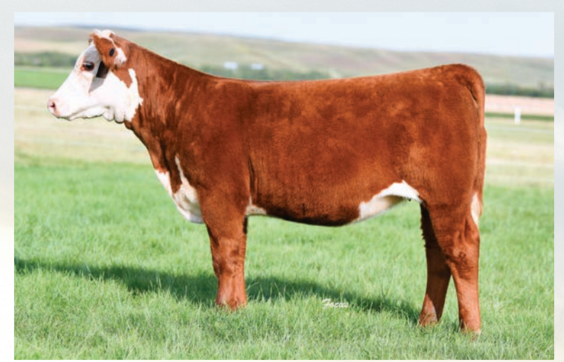
ECR Jackie 9244 :: Lot 16