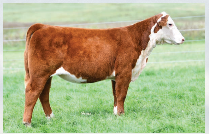
ECR BHR Miss Shaneless 9926 ET:: Lot 11

This one has all the pieces. She's stout and rugged with a huge hip, plenty of body and extended through the front 1/3