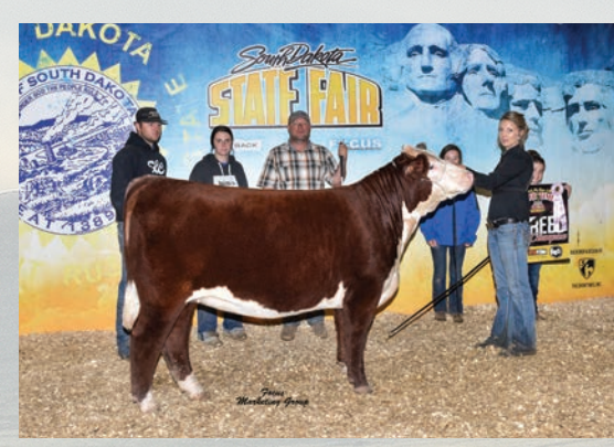
Reserve Champion Female, 2019 SD State Fair Open Show Grand Champion Female, 2019 SD State Fair Hereford Special Grand Champion Hereford Female, 2019 State Fair 4-H Grand Champion Hereford Female, 2019 SD Summer Spotlight Full sib to Lots 1 & 2