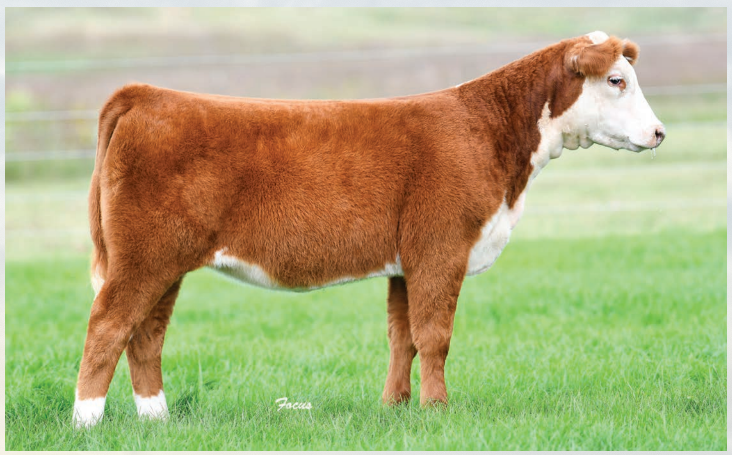
ECR 7586 Gretta 9380 :: Lot 9