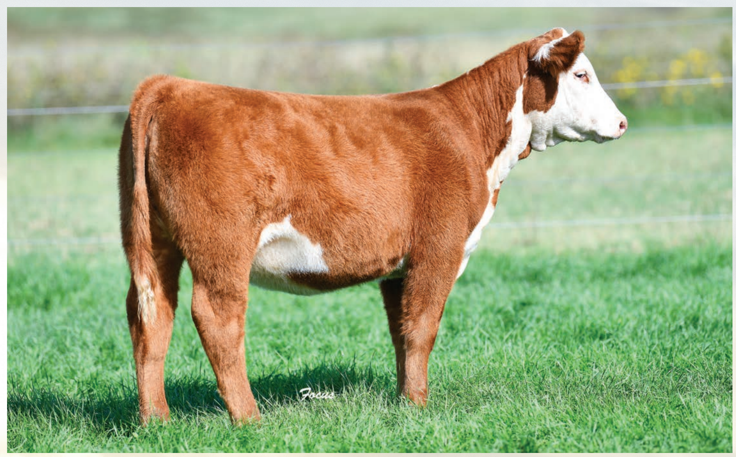
ECR Lady Shameless 9377 :: Lot 8