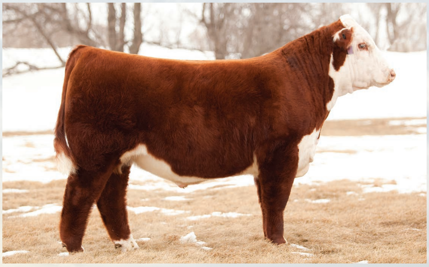
DKF RO Cash Flow 0245 ET :: Sire of Lots 21-27