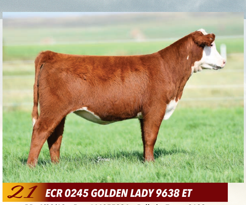
BD: 4/29/19 • Reg. #44055284 • Polled • Tattoo 9638