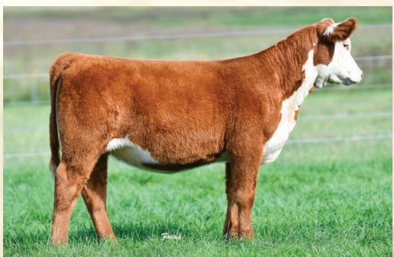
ECR Lady Shameless 9377 :: Lot 8