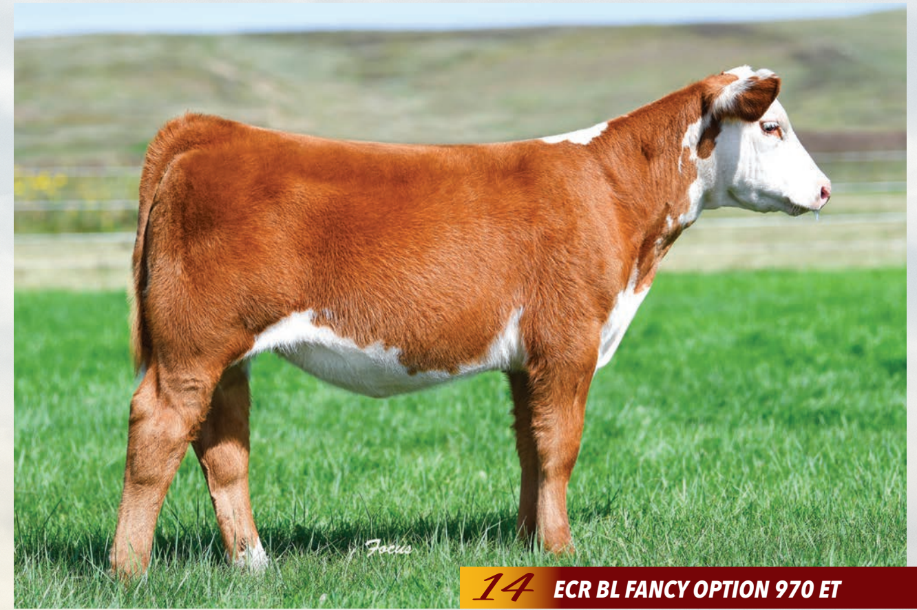
ECR BL Fancy Option 970 ET :: Lot 14