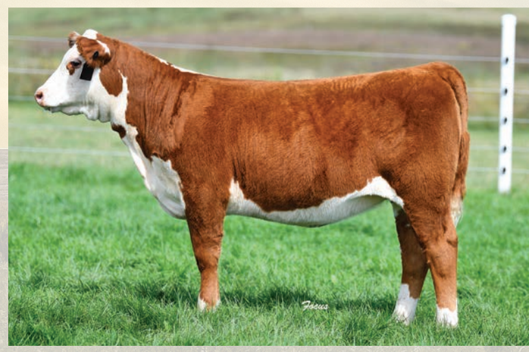
ECR 173D Candi 9478 ET :: Lot 5

Lot 4 has been a standout since birth and not just because of her wild color. She is very correct in her top line and tailhead with plenty of body and mass. Her mother is just getting started as a donor and will have influence in the future.