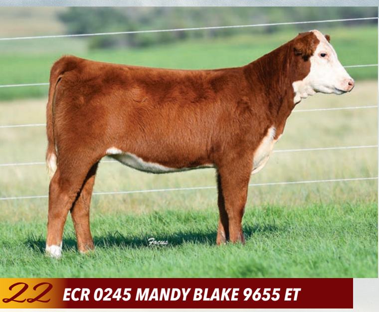
BD: 5/2/19 • Reg. #44056084 • Polled • Tattoo 9655