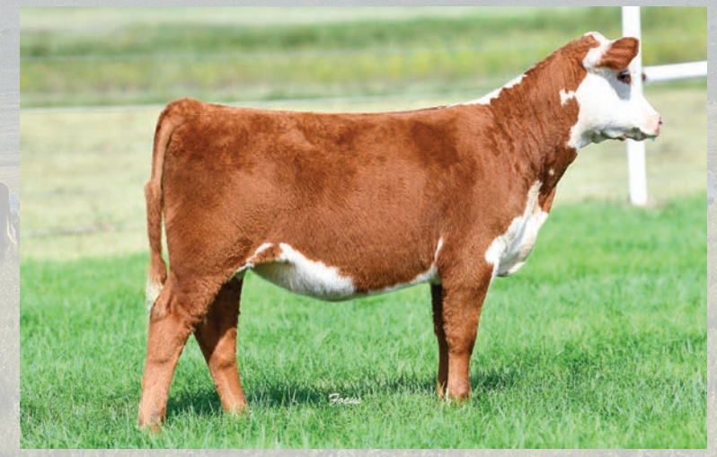
ECR 5575 Gabby 9252 :: Lot 7

This Redemption daughter has been a standout and a favorite by all who have seen them early. The best way to describe her is flawless. She is perfect structured, feminine yet so massive and powerful. She is the kind that wins at the big shows. If you are looking for the elite power female that will be competitive on the most elite level and then when you are done have the cow power to generate some serious money this heifer needs a serious look. My kind of cattle. Power, mass, length, width, SOUND.