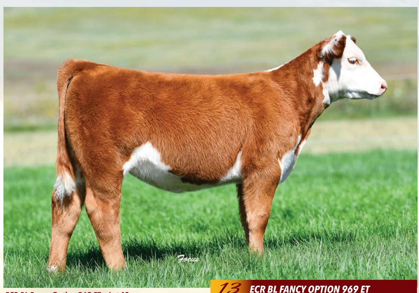
ECR BL Fancy Option 969 ET :: Lot 13

BD: 5/18/19 • Reg. #44055238 • Polled • Tattoo 969