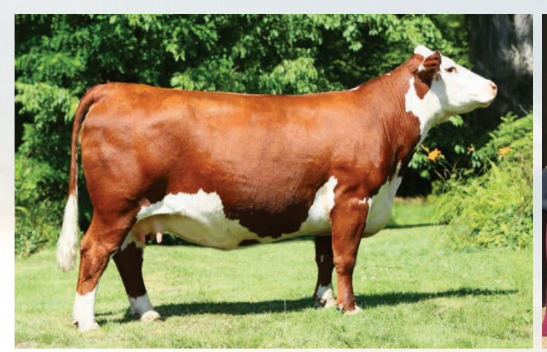
SULL Olivias Time:: Dam of Lot 4