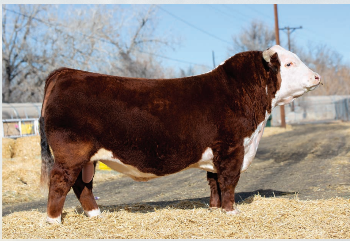
ECR CHEZ L18 Sensation 7076 ET :: Sire of Lots 33 & 34