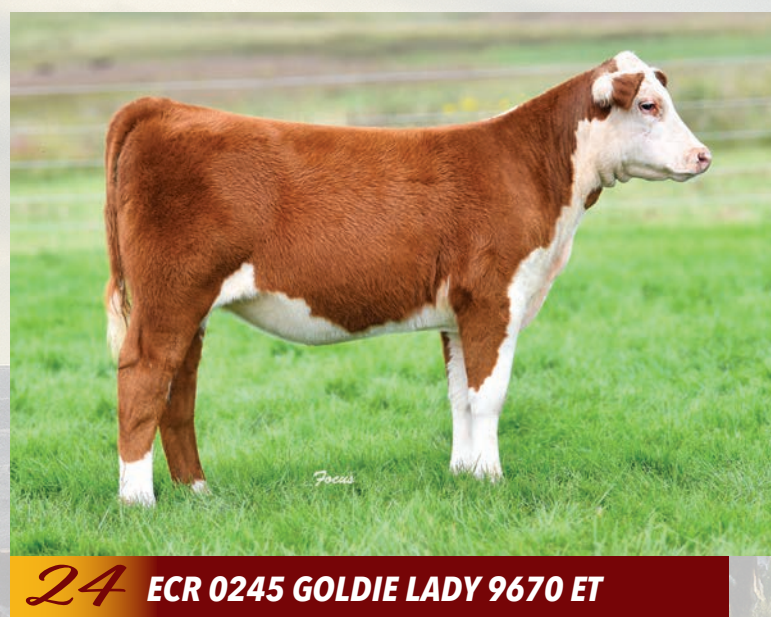
BD: 5/5/19 • Reg. #44055282 • Polled • Tattoo 9670