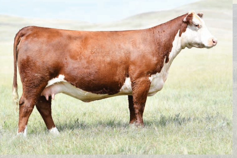
ECR Lady Flow 211 ET :: Dam of Lot 1 & 2

Tremendous amount of future in this female. She resembles Hollis's fall that did some winning in terms of her growth curve and the way she is put together. She has all the pieces and will be a bit later maturing but when she gets there, I expect big things from this female.