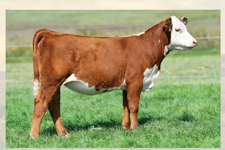
ECR BHR Miss Sooner 9176 ET :: Lot 37