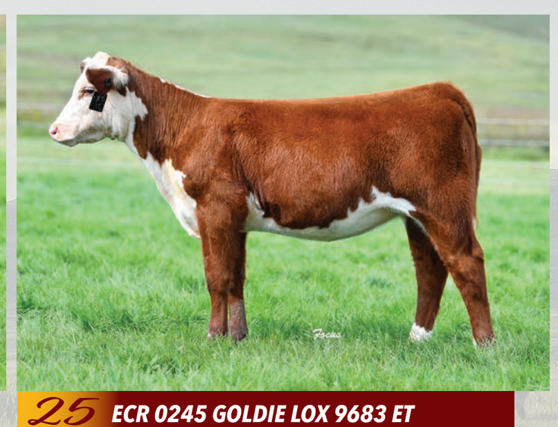
BD: 5/8/19 • Reg. #44055288 • Polled • Tattoo 9683