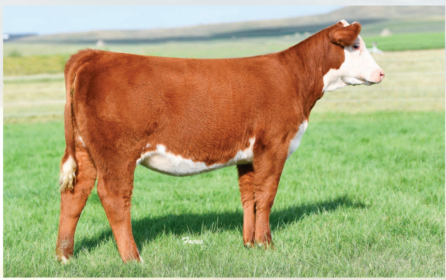
ECR 2296 Lady Flo 9323 ET :: Lot 2