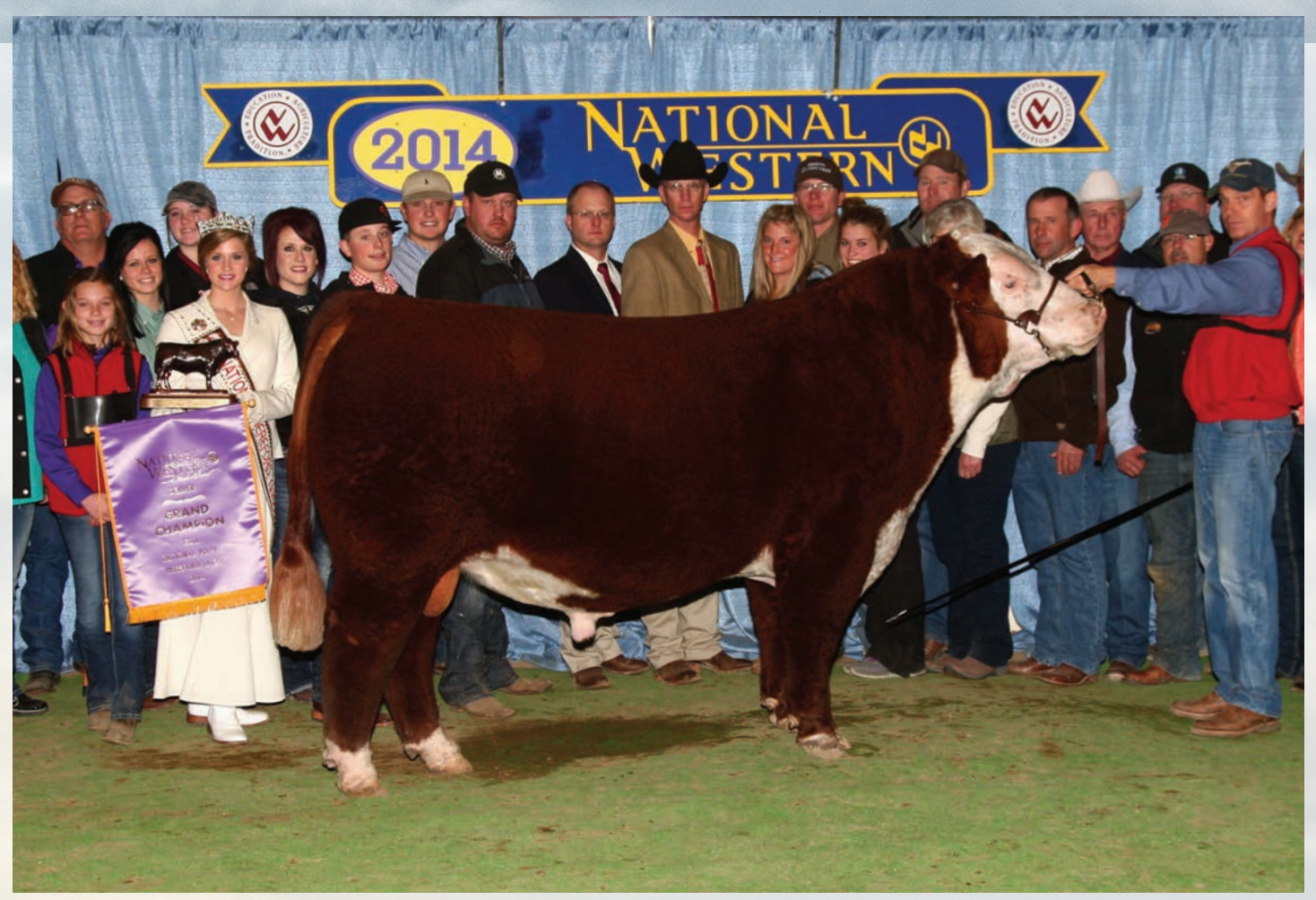
ECR Whomaker 210 ET :: Full sib to Lots 21-27 :: National Champion Bull 2014 NWSS