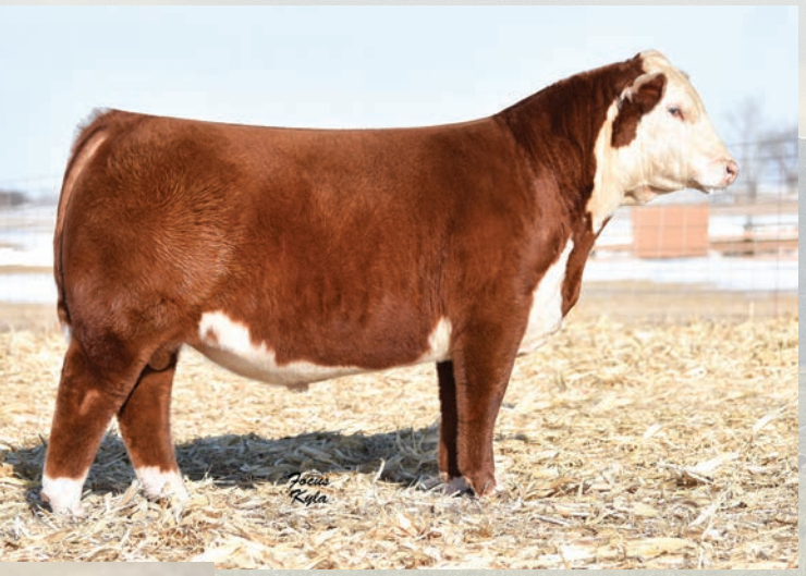
ECR Shameless 7586 ET :: Sire of Lots 8-12

She has a really sweet look and just needs a little time. If you have a history of maybe getting your show heifers a little chunky in the past this heifer would be a great option as she is one that will be able to handle some feed and still keep herself looking like a lady.