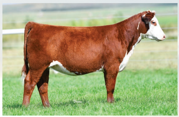
ECR 3304 Miss Tobey 9389 :: Lot 35