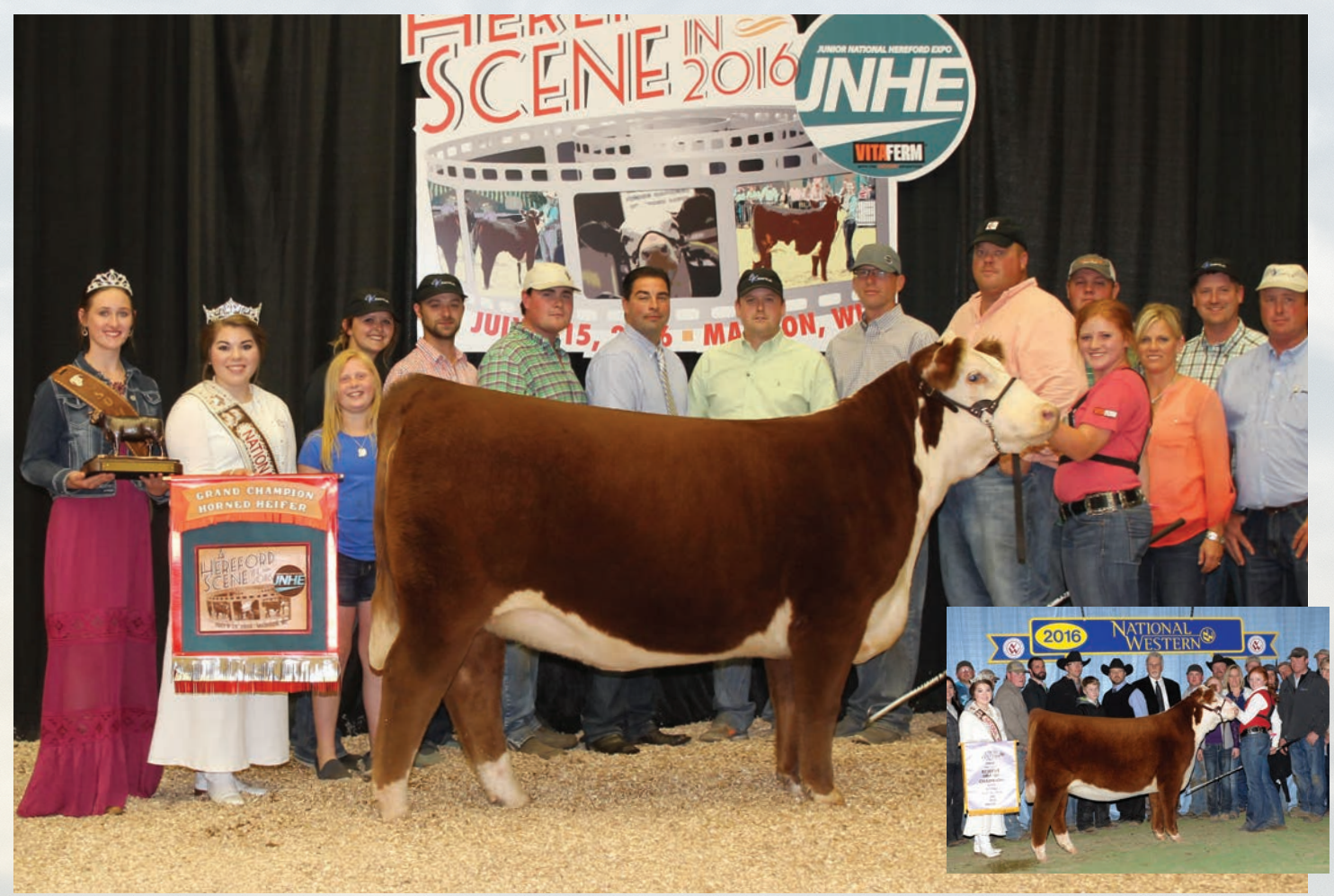
ECR Candi 5451 ET :: Full sib in blood to Lots 1-3 2016 NWSS Reserve Champion Horned Female & 2016 JNHE Champion Horned Female