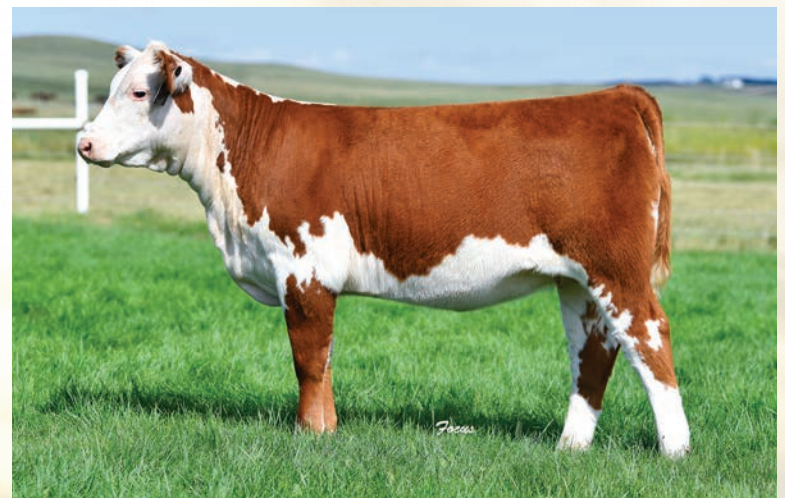
ECR Miss Olivia 9331 ET :: Lot 4