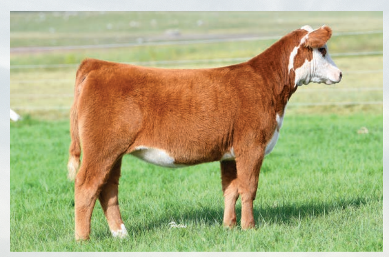
ECR LP Sabrina 9911 :: Lot 29