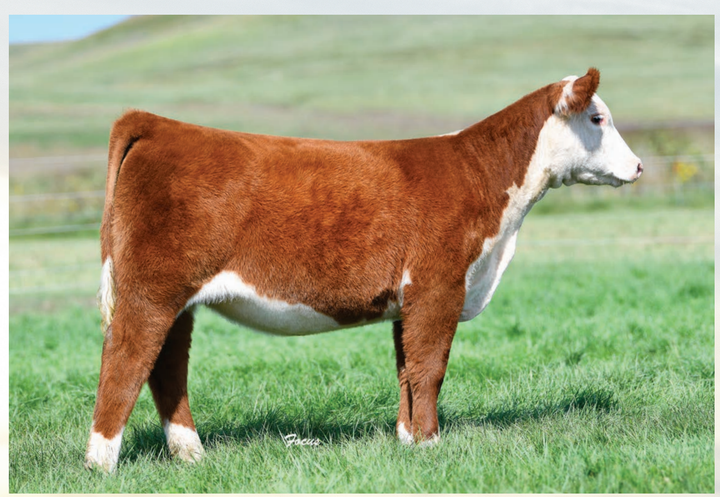
ECR LP Sugar 9171 ET :: Lot 1