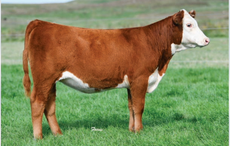
ECR TH 53D Miss Diamond 901 :: Lot 30