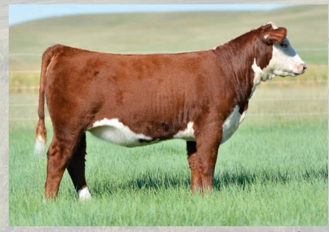
ECR Miss Donna 6898 ET :: Dam of Lot 3