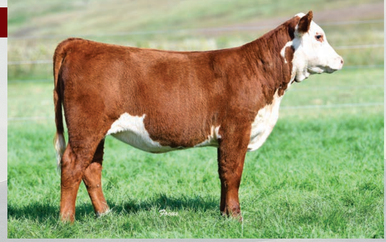
ECR 7076 Misty 9111 :: Lot 33

These two 7076 daughters have power in the blood and are destined to be great cows when their show career is over. Looking for a female for your replacement pen both of these are great options to gain a little COW power.