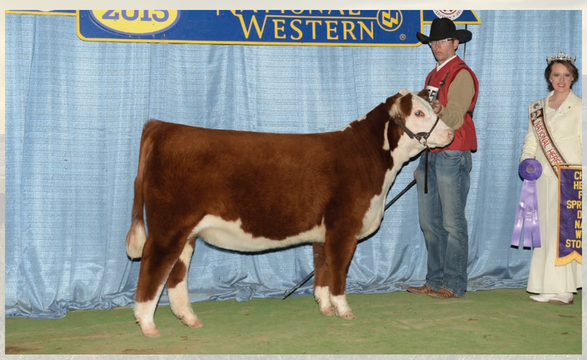
ECR Miss Sensation 4328 ET :: Dam of Lots 31 & 32

BD: 5/9/19 • Reg. #44056067 • Polled • Tattoo 9903