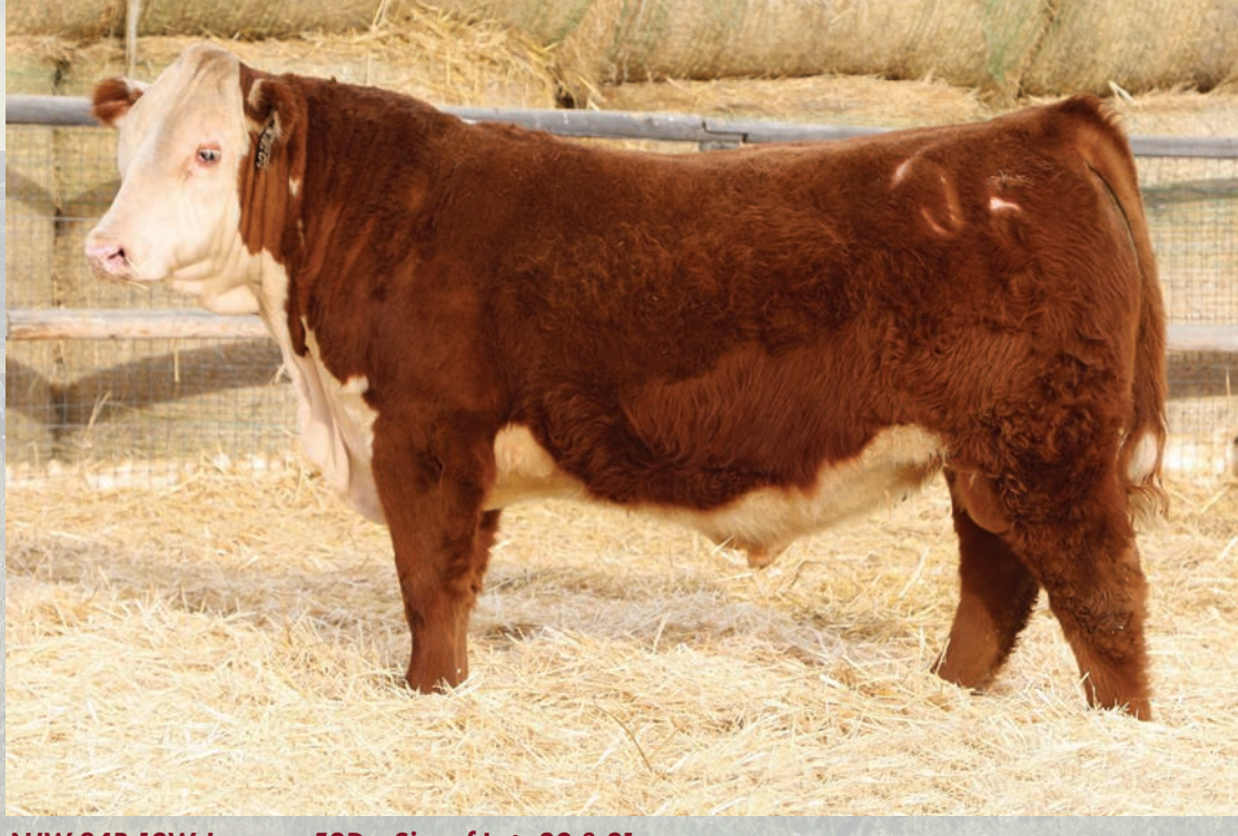
NJW 84B 10W Journey 53D :: Sire of Lots 30 & 31

The result of a bred heifer purchased in last year's sale. She has a sweet personality and would be a great project for a younger junior. She is long bodied with plenty of rib shape and depth.